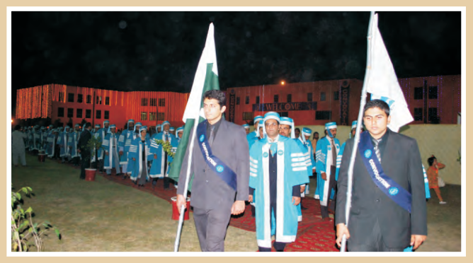
A view of the graduates' procession

The 4th UMT Convocation was attended by a large number of family members and friends of graduating students as well as dignitaries form the corporate world. Dinner was served to the guests and graduates at the end of the convocation.