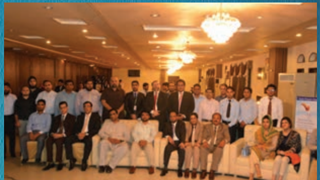
Group photo of attendees of ILM Fund Dinner hosted by UMT