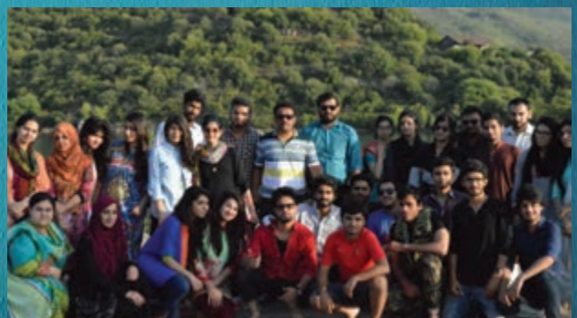
UMT students snapped during their visit to Khanpur