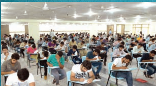
Candidates seeking admission into UMT take the admission test