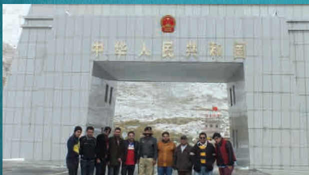
UMT Alumni visit Hunza, Khunjab Pass and Fairy Meadows from September 5 – 11, 2015