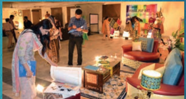
School of Textile and Design students display their thesis work