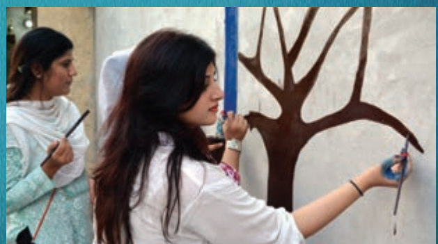
UMT participants in UN Wall Painting Campaign by United Nations, Pakistan