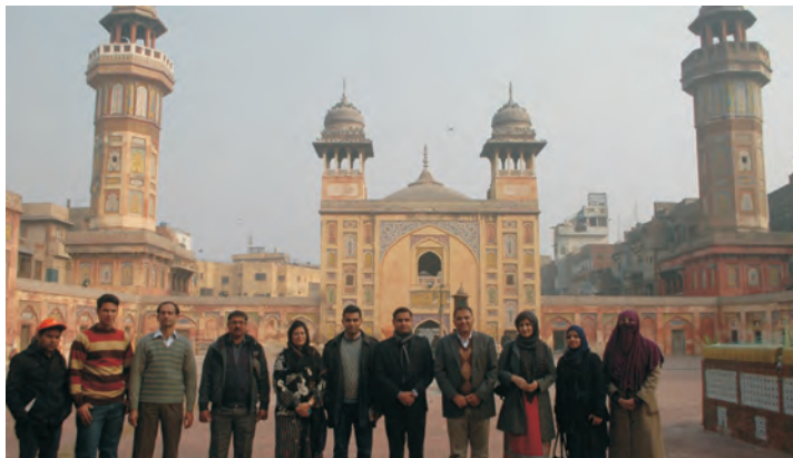
Department of Social Sciences faculty and staff tour the walled city