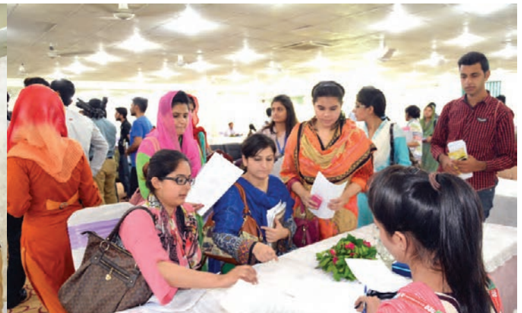
Students through the desks of media representatives