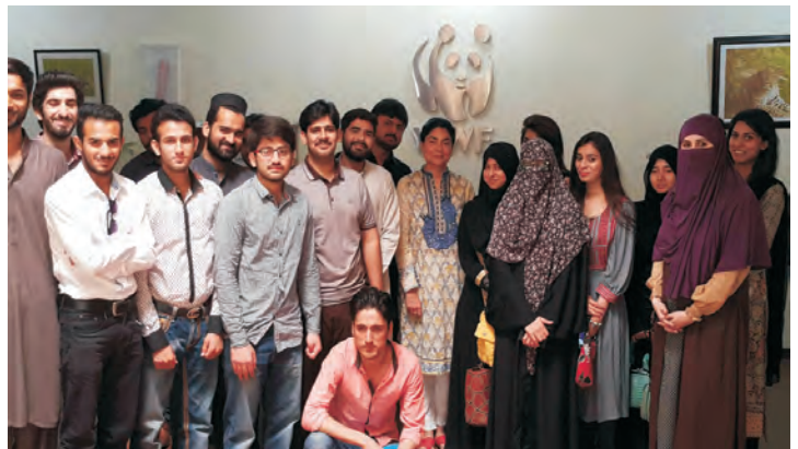
BS International Relations students visited World Wide Fund for Nature, Lahore