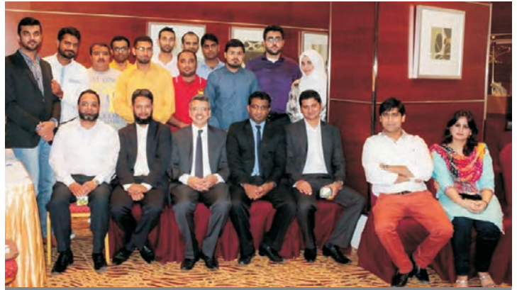
UMT alumni serving in UAE snapped during a get-together