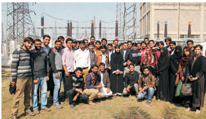
IEEE UMT Student Branch visit 220 KV NTDC Grid Station in Wapda Town, Lahore, on February 13, 2015