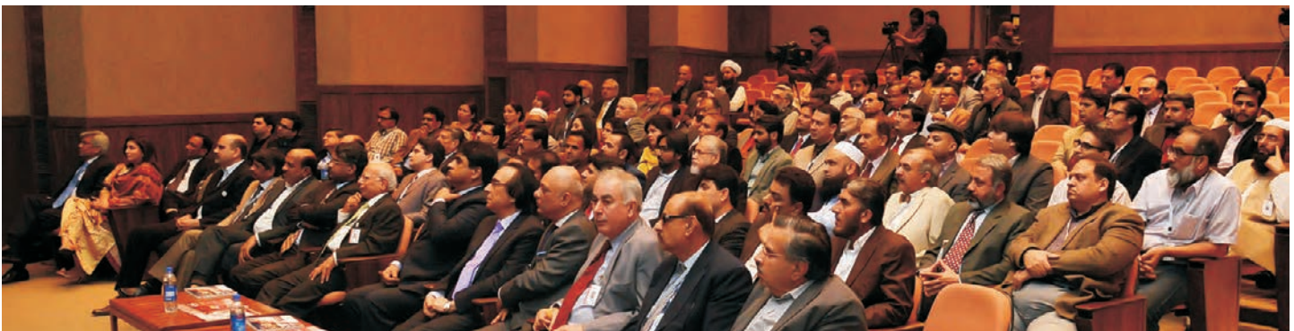
Attendees of the 2nd NBEAC Deans and Directors Conference 2015