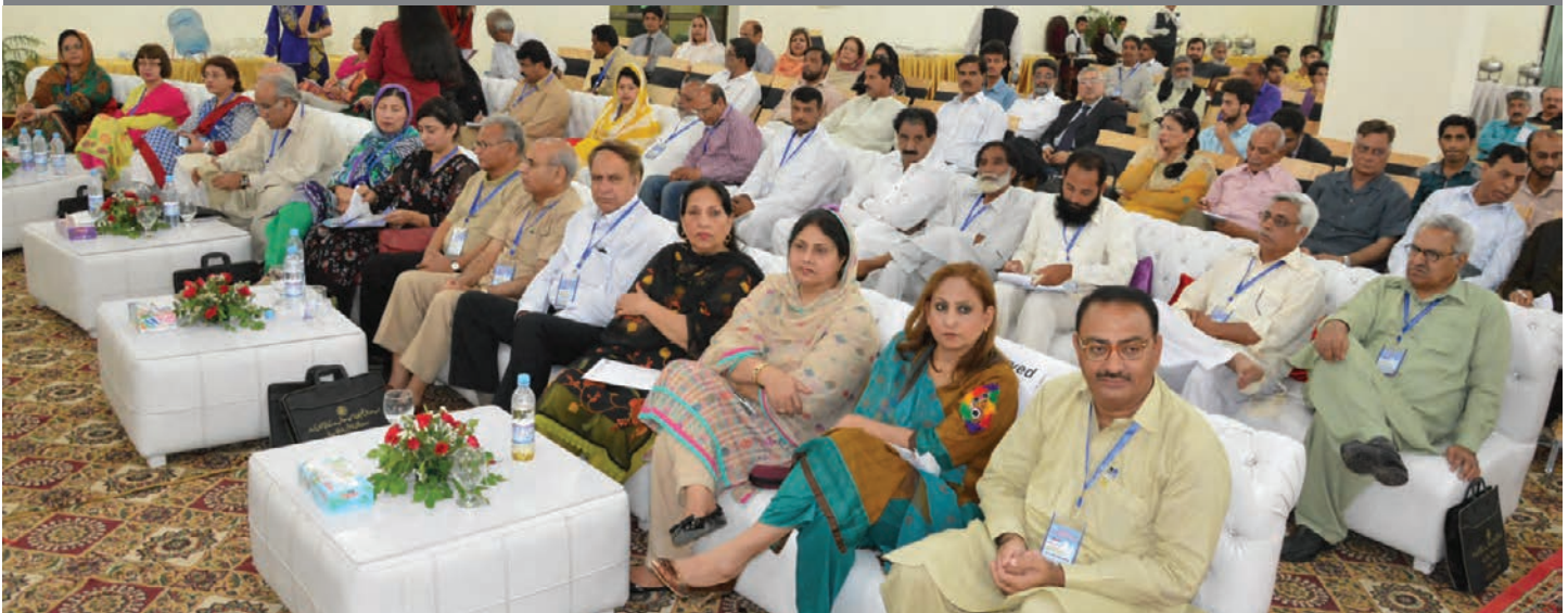
A view of the large gathering of writers, intellectuals and general public attending the conference

Renowned columnist and poet Atta-ul-Haq Qasmi inaugurated a literary conference at UMT on May 11, 2015 organized in collaboration with Pakistan Academy of Letters on the theme of 'role of literature and writers in building a peaceful society'.