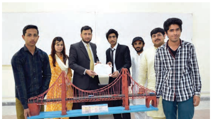
Students of civil engineering snapped with their model