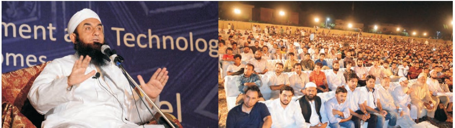
Maulan Maulana Tariq Jameel, renowned Islamic scholar, delivering a talk at UMT Campus