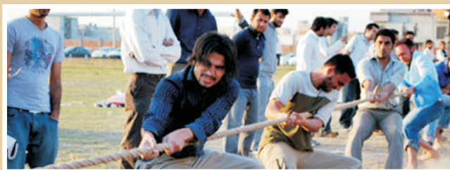
Players battle for victory as they try to pull the opposing team to their side