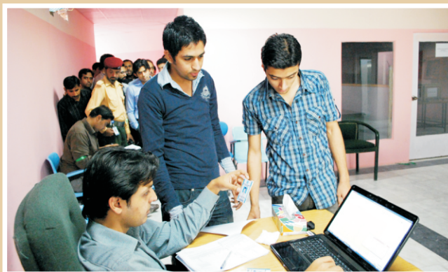
Students cast their votes during the elections