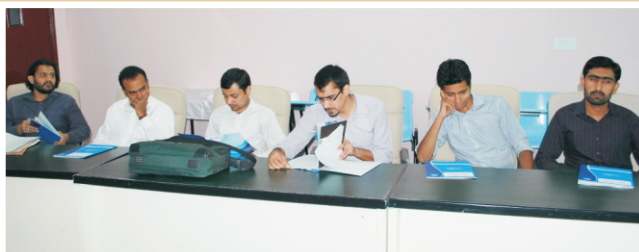
MS Management students attend the orientation