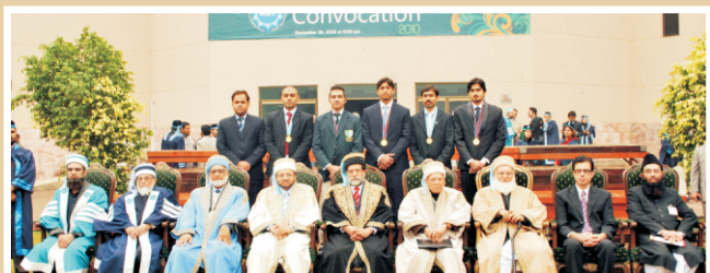
Recipients of the special Gold Medals for outstanding achievements in sports snapped at the Convocation