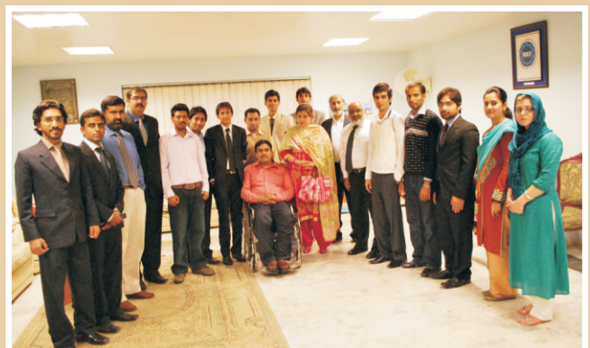
Participants and presenters of the seminar snapped together

At the end, a question and answer session was held. Students were interested in all aspects of managing an independent venture, especially those related to personal sacrifices and financial barriers. The rationale for inviting all these entrepreneurs was to enrich the students with practical knowledge which they would be using in their future professional lives. All the guest speakers were presented mementos as good will gestures.