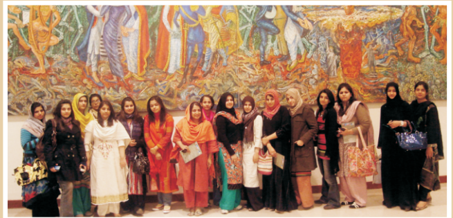
UMT Students snapped at the Pakistan National Council of Arts, Islamabad

The participants visited the Pakistan National Council of Arts where they saw marvelous paintings, sculptures and other artistic works by renowned artists of Pakistan including Saadeqain, Ghulam Rasool and many others. After the visit to the Council, the bus left for the Saidpur Village , which has been beautifully transformed into a recreational spot. They enjoyed a sumptuous lunch at Des Pardes Restaurant . The last place visited by the participants was Daman-e-Koh where everyone witnessed the famous scenic view of Islamabad city over a cup of tea.