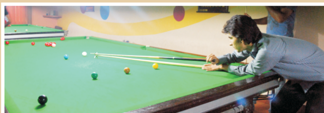
A snooker player concentrates before taking aim