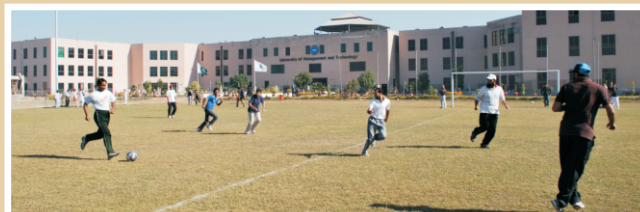
UMT employees test their mettle during the soccer tournament