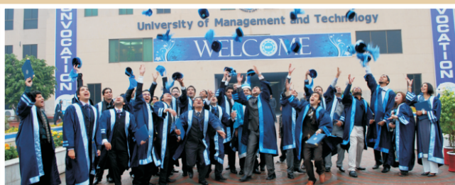
New UMT alumni celebrate their graduation