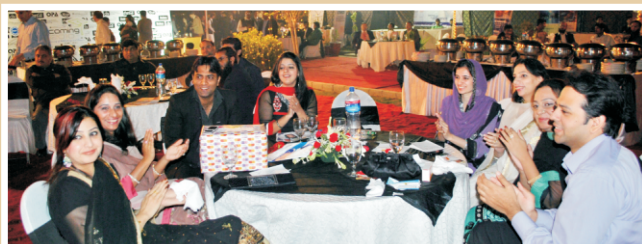
Alumni/ae share light moments with each other at the Homecoming 2010