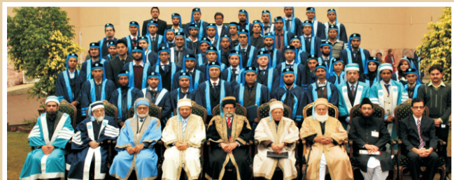
UMT graduates snapped with the Chief Guest after the Convocation