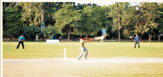
A view of the cricket match during the tournament

The UMT Sports Club and Office of Participants' Affairs (OPA) organized the 10th Rector Cup Tape Ball Cricket Tournament at Model Town Cricket Ground where 24 teams participated from different programs and batches. The tournament was held from November 02-04, 2010. A large number of participants from UMT turned up to watch the tournament. Musketeers won the tournament while Mascot secured the second position. An interesting feature of the tournament was that all the participating teams were sponsored by different faculty members. The top 16 teams of the tournament comprised of Musketeers ( Manzar Bashir ), Mascot 9 ( Syed Khawar Nadeem Kirmani ), UMT Pride ( Rana Iftikhar Ahmad Director OPA), Lahore Stallions ( Khuram Shahzad ), Warriors ( Rouf Ali ), UMT Lions ( Farukh Abbas ), YFC-35 ( Ibrahim Tahir ), MCom Rockers ( Amir Hussain ), Bullet II ( Ahmed Malik ), Asians II ( Hassan Lali ), 9 Stars ( Muhammad Saleem Akhtar ), UMT Champions ( Mohsin R ), Azad II ( Farooq ), Zalim II ( Nouman Nadeem ), 39th Battallion ( Ahmad Hassib Hassan ) and Kunal II ( Faran Awais Butt ).