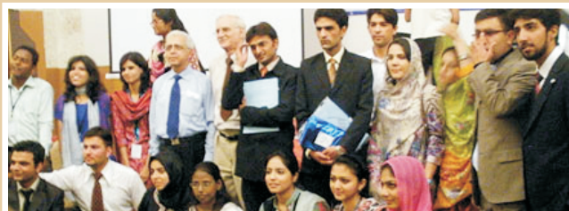
Participants of the TI Convention in Karachi