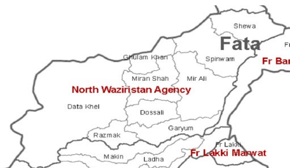
Map 2 – My AOR in North Waziristan Agency

However, jani khels and khaddar khels from the Detta khel area (who had a reputation for violence) became close ally, and were influential in spreading our appeal for peace and harmony.