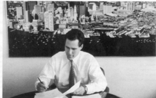
Bain years Romney's job-creation claims are back under fire

A metal exchange in play p48 Housing's latest hurdle: The explosion of student debt p49 China's savers get smarter p50 Israel's steady stock market p51 Bid & Ask: The week's deals p52