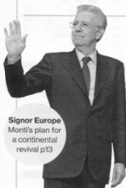
Signor Europe Monti's plan for a continental revival p13

Gingrich loves Lean Six Sigma. Its creator loves him back p33 Obama spoils for an election year light on taxes p34 Freeing up spectrum for rural wireless p36