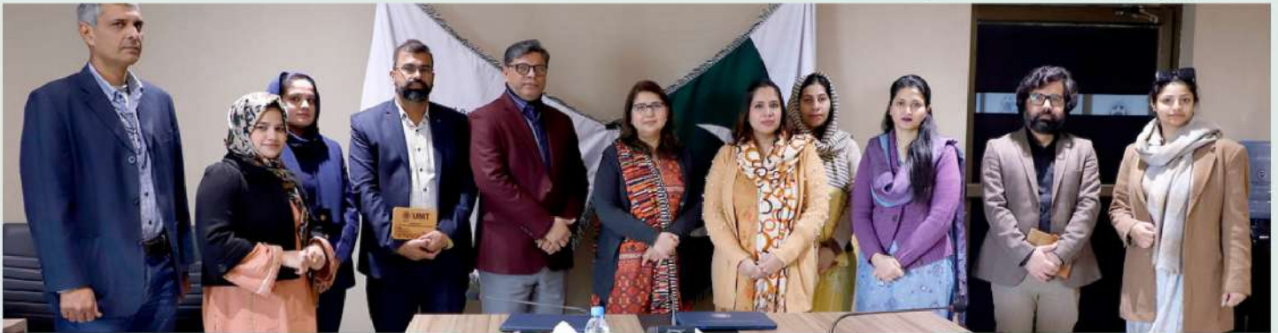
A group photo at the MOU signing ceremony