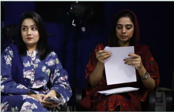
Media Students preparing for auditions

Our aspiring media students were auditioned by the Team Dunya TV. The audition conducted by Team Dunya TV provided aspiring media students with a unique opportunity to showcase their talent and skill in journalism, broadcasting and media production. They gained valuable insights into the real-world demands and expectations of the media industry. They learned about the importance of presentation, communication skills, on-camera presence and essential qualities for success in journalism and broadcasting. Moreover, the audition exposed to them the competitive nature of the field and encouraged them to strive for excellence in their craft.