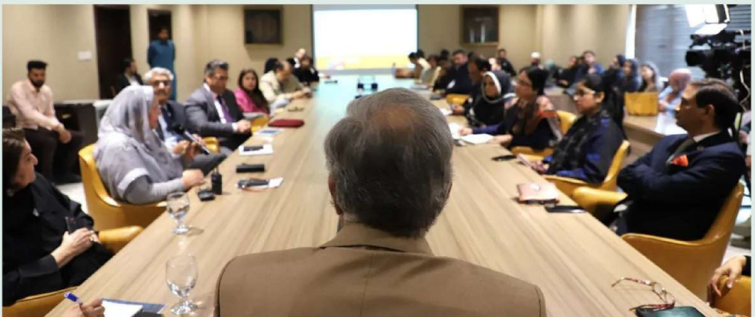
An overview of the roundtable meeting