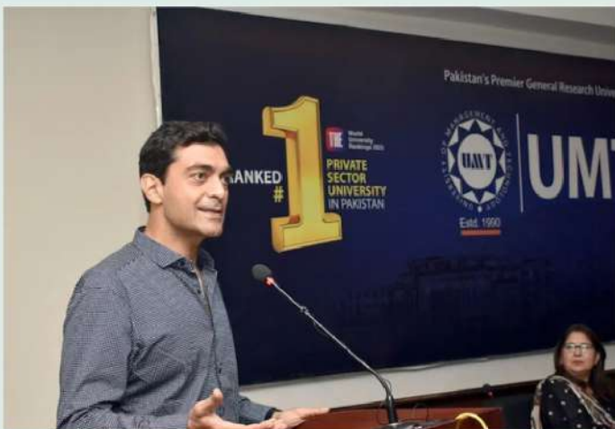
Alyy Khan addressing as guest speakers

The interactive session with Alyy Khan organized by SMCS gave students clear knowledge of the media industry, explaining to them the importance of hard work and dedication in production and direction. Through his anecdotes and stories, the students learned about the necessity of making consistent efforts to achieve their goals. His firsthand experiences served as an inspiration for the students, highlighting the pitfalls and rewards of media. By actively participating in the question and answer session, the students had the opportunity to further deepen their understanding of media.