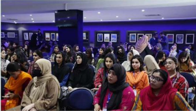
Students attending Wild Life Photography Exhibition at SMCS, UMT

The Office of Communications conducted a Wildlife Photography Workshop and Exhibition featuring the award-winning professional photographer Asim Cheema. He taught the SMCS students how to enhance their photography skills and have a clear understanding of wildlife conservation. He discussed technical aspects of wildlife photography including composition, lighting and capturing fleeting moments in nature. The students gained a deeper knowledge of the importance of wildlife conservation and the role photography plays in raising awareness about endangered species and their habitat. The workshop not only honed their practical photography skills but also inspired them to use their craft as a tool for environmental advocacy and storytelling. Overall, it was an enriching experience that empowered students to harness the power of visual communication for positive change in the realm of wildlife conservation.