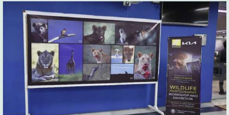
Wild Life Photography Exhibition at SMCS, UMT