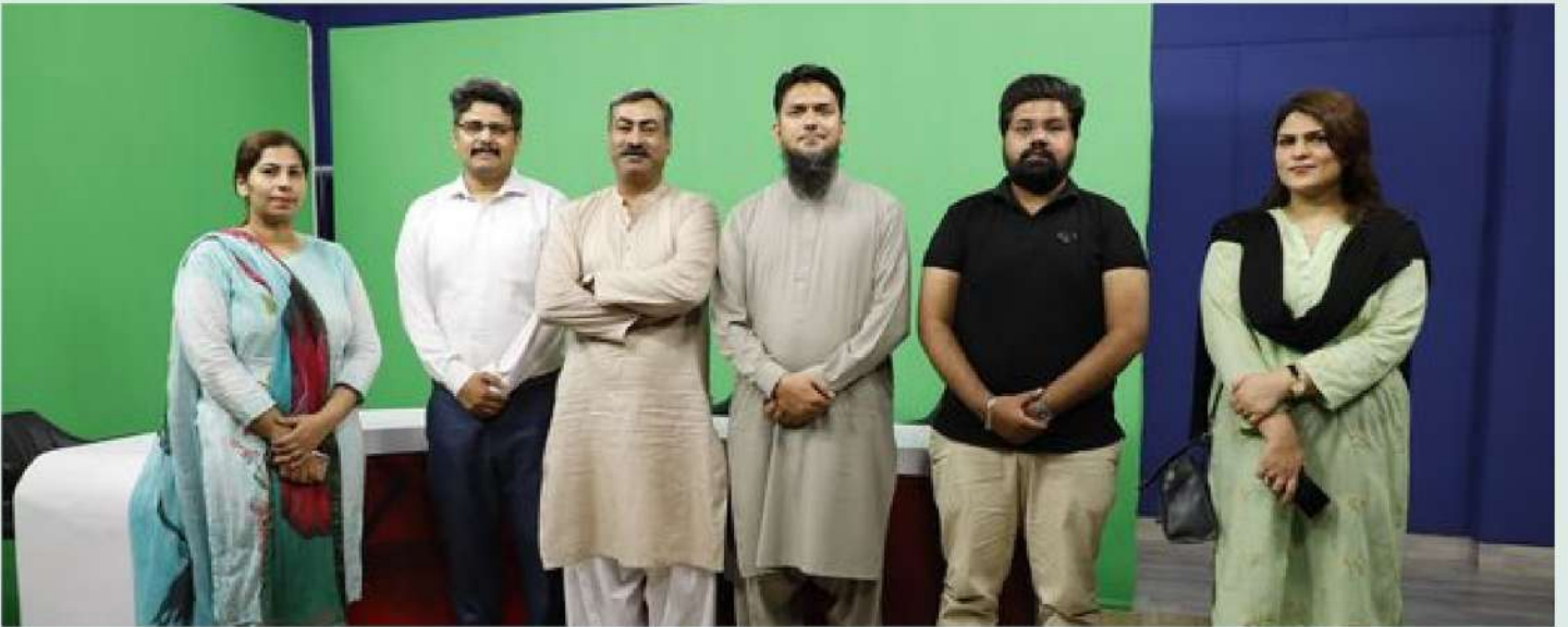
SMCS Faculty Group Photo with UMT Sialkot Media Department Faculty members