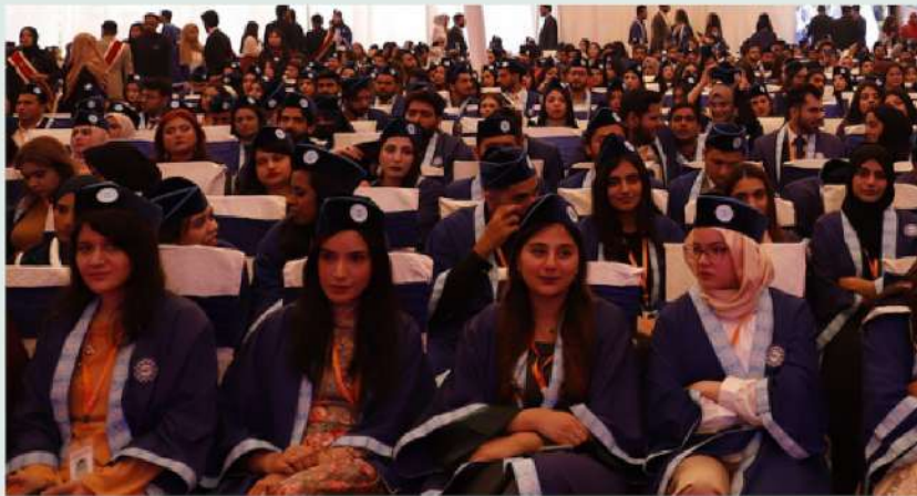
SMCS students enjoying the moment