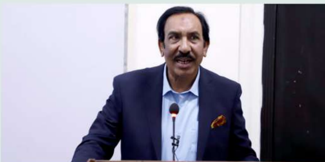
Actor Nayyar Ijaz speaking to the SMCS students