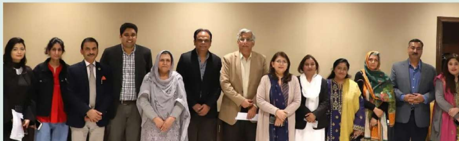
Panelists along with Dean SMCS and faculty members