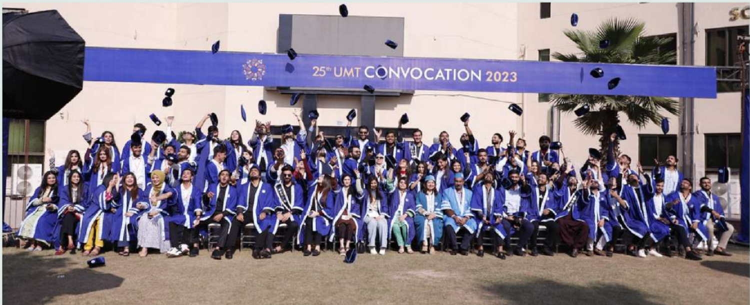
A group photo of SMCS students along with Dean SMCS and faculty members