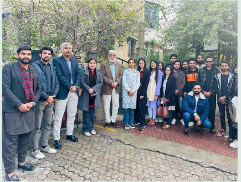
SMCS students group with the owner of Message Communication after the Tour