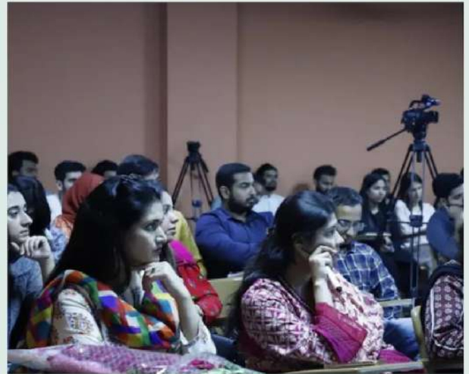
Students and Faculty members attending the Guest lecture