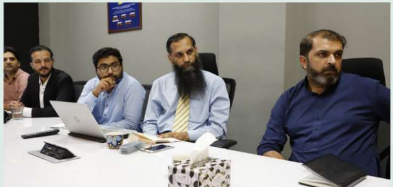
Ph.D. students grabbing the guidance