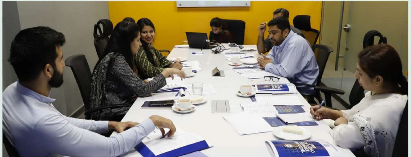
Brainstorming for improvement in courses