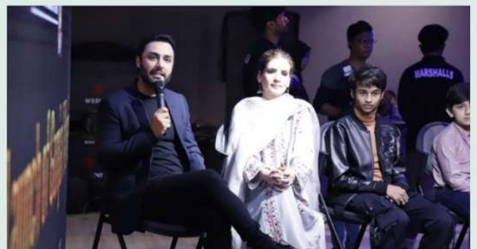
Movie Gunjal cast