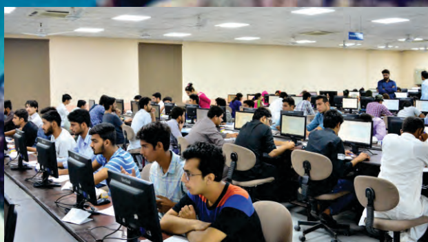
Students appear for the admissions test for Fall 2016