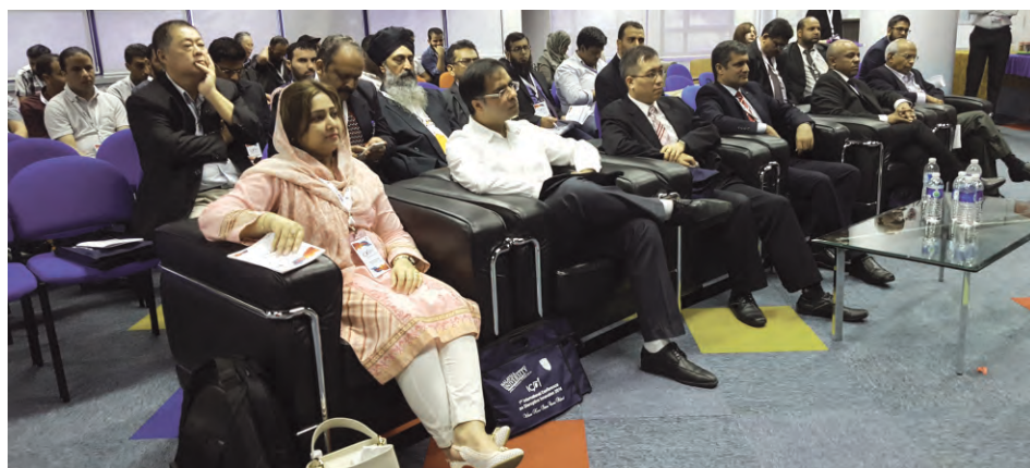
Conference participants during a presentation

The Journal of Management and Research (JMR) partnered this conference. JMR is an HEC recognized journal managed by Department of Management, SBE. Selected papers from this conference will be published in the upcoming issue of the JMR.