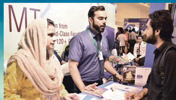
Student in career discussion with UMT team during Education and Career Expo at Faletti's Hotel