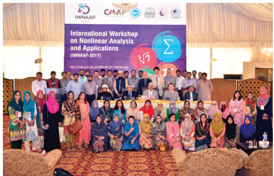
Participants and organizers of IWNAAP 2017 snapped at the conclusion of the event