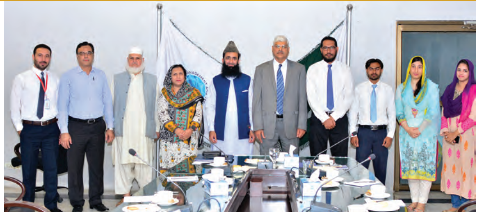
Signatories of the MoU get together for a photograph after the signing ceremony