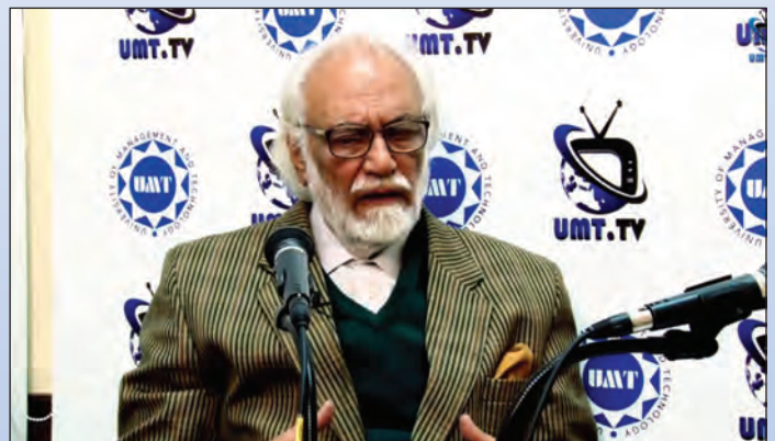
Talk with Sardar Asif Ahmad Ali, former Foreign Minister of Pakistan