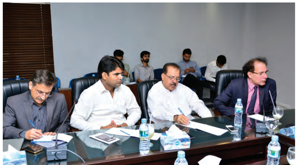
Participants during the debate on FATA reforms