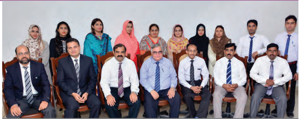
Attendees snapped at the conclusion of the workshop