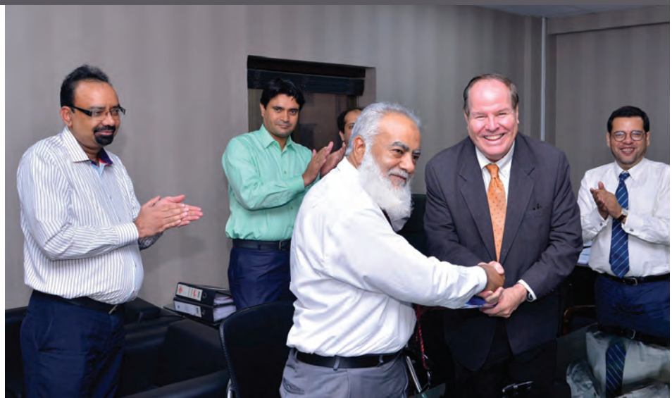
Signatories of the MoU between UMT and Wilshire Group shake hands after the signing ceremony