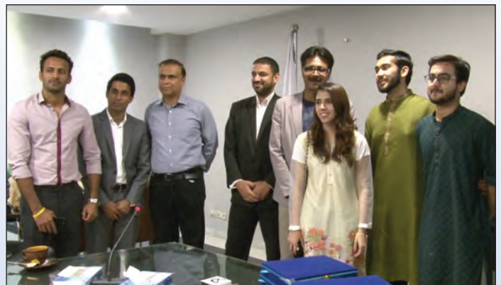
Pakistan hockey team visits UMT TV