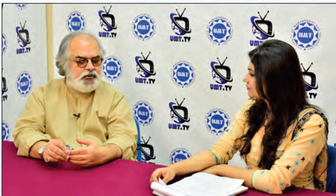
Talk with Nawab Ghous Bakhsh, former CM Balochistan