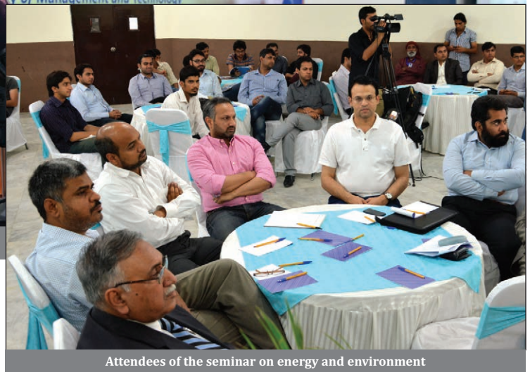
Attendees of the seminar on energy and environment