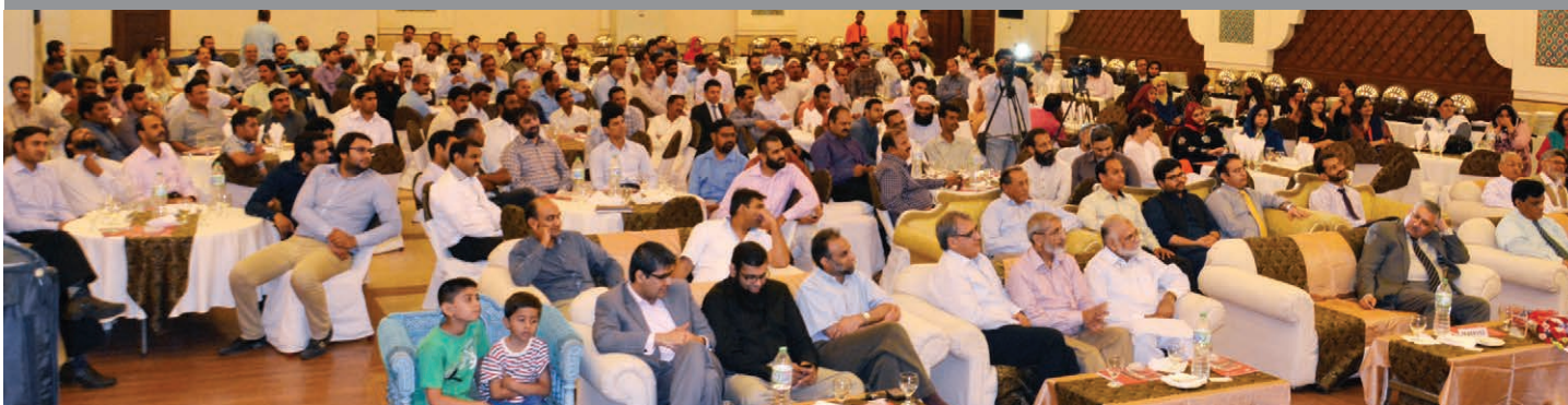
Faculty and staff members gather for the Long Service Acknowledgement Award ceremony