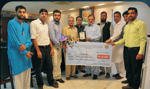
Winning team of COMPEC 2014 snapped with their hexapod robot