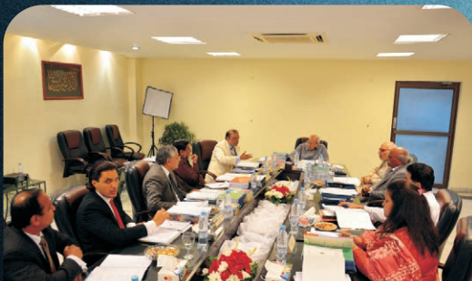
Meeting of the Board of Governors in progress at UMT