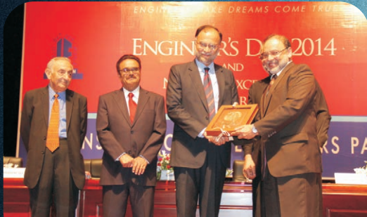
Minister for Planning and Development Ahsan Iqbal presents IEP National Excellence Award to Rector UMT