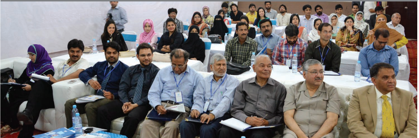
Attendees of the international conference listen to the proceedings