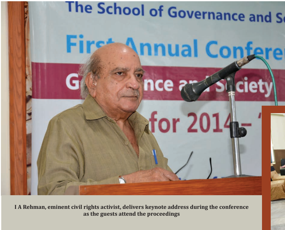
I A Rehman, eminent civil rights activist, delivers keynote address during the conference as the guests attend the proceedings

At the time of partition, the Pakistani legal system entailed only two crimes warranting capital punishment, murder and 'fitna' and now there are 28, without a legible explanation for this exponential increment.