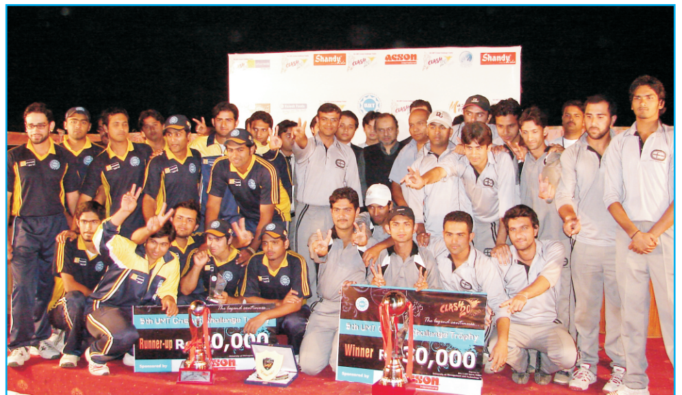
CFE (winners) and UMT (runners-up) team pose together at the conclusion of the closing ceremony