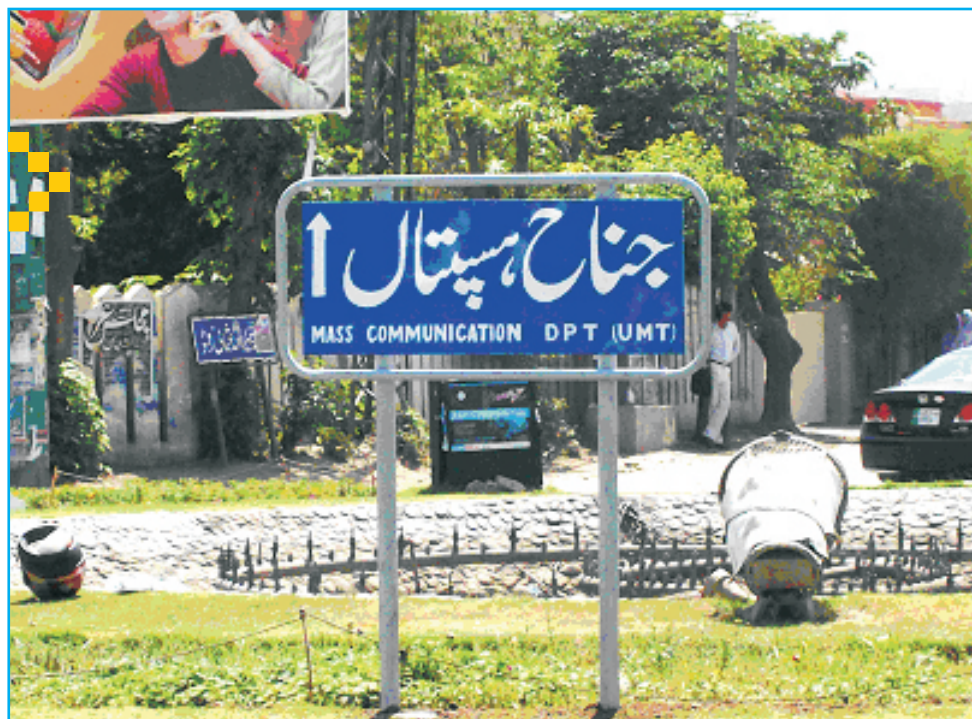
Directional signboard put up by the students of the Mass Communication Department, UMT