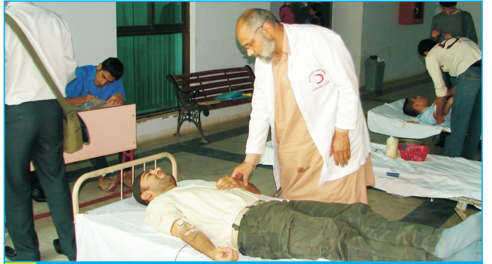
Students donating blood during the blood camp set up at UMT