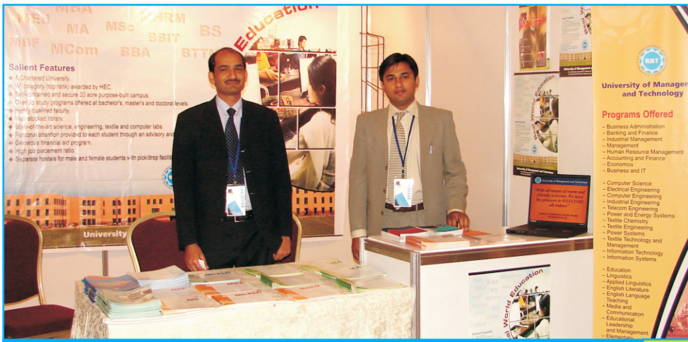
The UMT team at the 4th Dawn Expo, Lahore