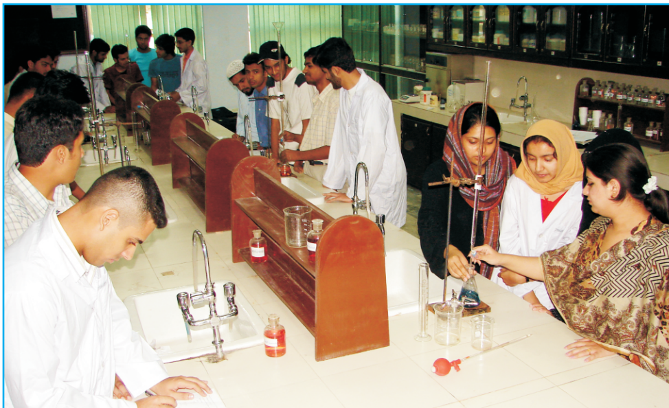
Students working at the chemistry laboratory

Improvements in laboratory infrastructure will go a long way in strengthening UMT's science and engineering programs. The University management has taken a step in the right direction by investing in its laboratory facilities. One hopes that our students would make full use of these facilities and complement their studies by practical application.