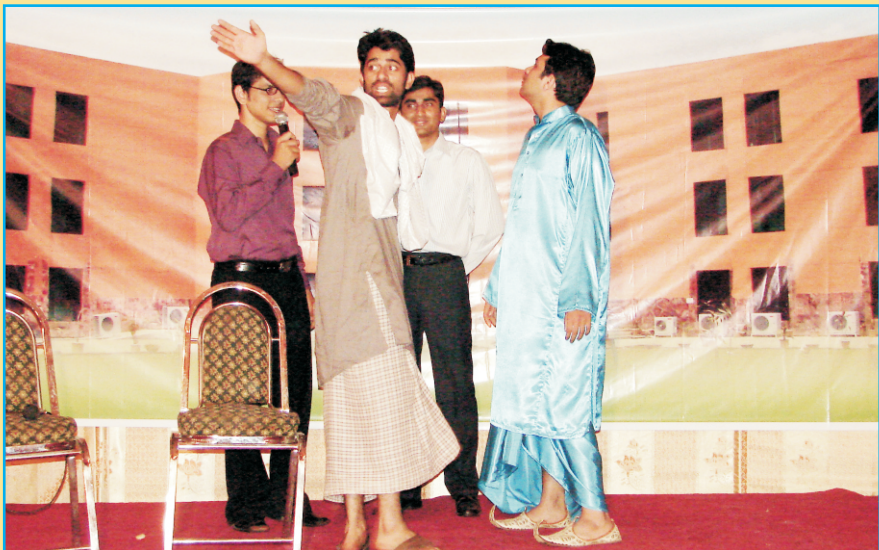
Students performing during the play

At the end, faculty members addressed the students. Students' representatives also gave a note of thanks. The graduating students took an oath of commitment to uphold the dignity of UMT, stay true to the moral code of their religion and do their bit for the progress of the nation.