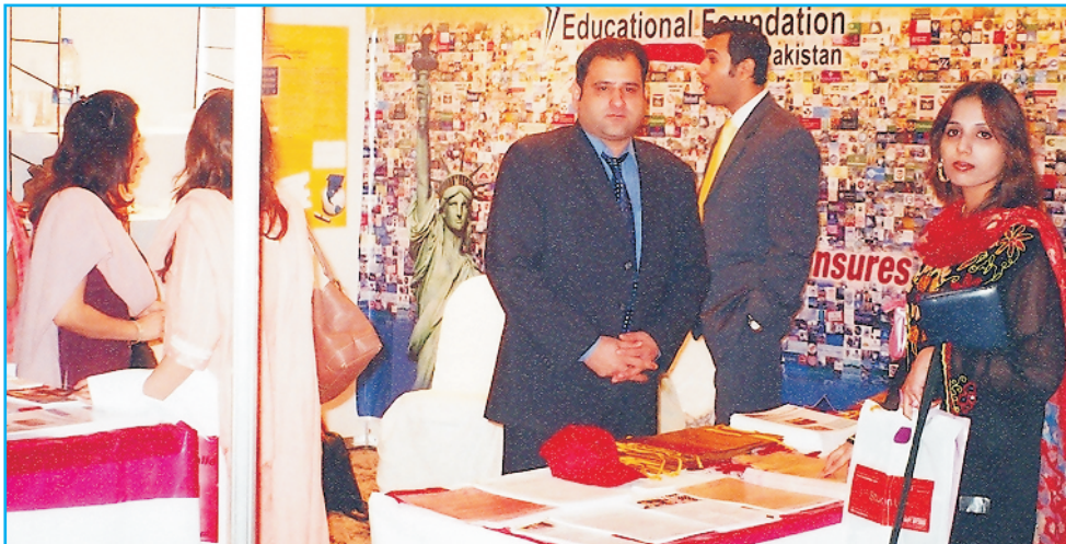
A view of the 4th Dawn Expo, Rawalpindi