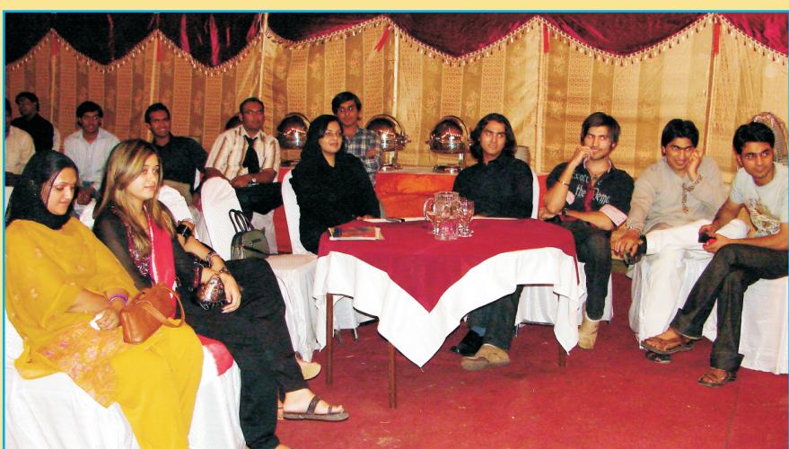
Students enjoying the play