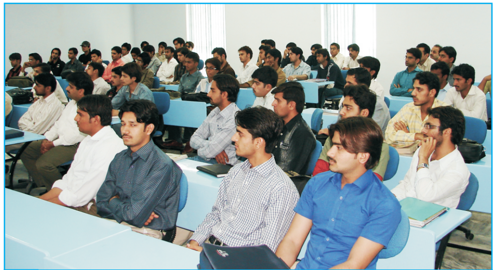
Participants of the welcome party arranged by the Leaders Forum

We strongly appreciate the initiative taken by the management and students of the Mass Communication Department to create awareness of the importance of donating blood to save lives. Such social service activities create a sense of community among the participants and should be encouraged in our students.