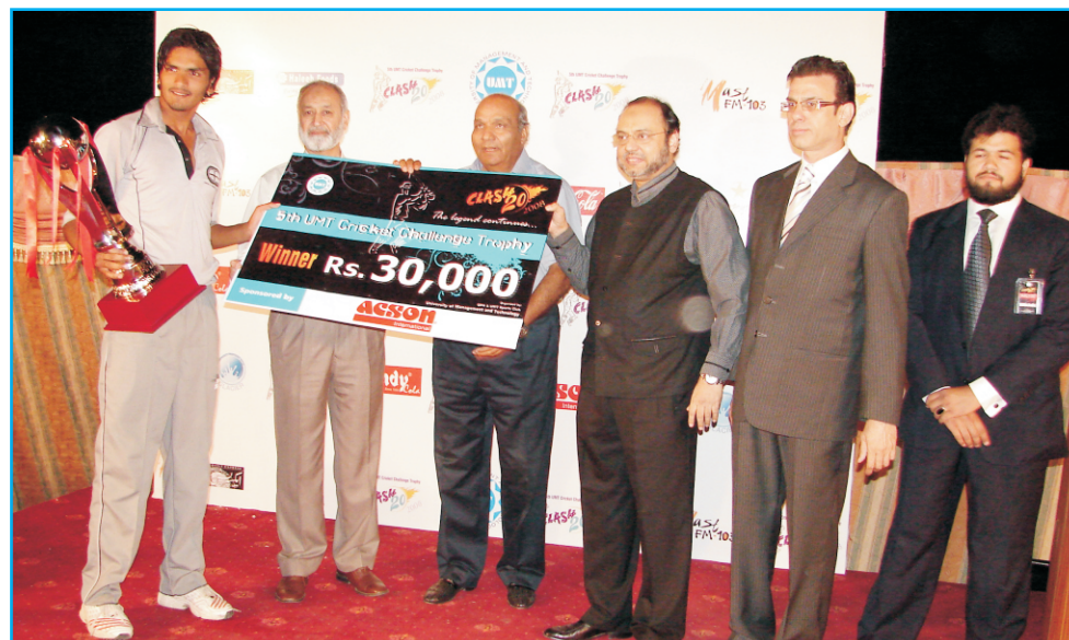
Captain of the CFE team receiving the 5th UMT Cricket Challenge Trophy

A final word of appreciation for the sponsors of the 5th UMT Clash 20 Cricket Challenge Trophy is in order as this event could not have been held on such a large scale without their support. The 5th UMT Cricket Challenge Trophy 2008 was sponsored by Coca Cola Pakistan , Shandy Cola (Platinum Sponsor), Glacier Water , Mast FM 103 , Daily Times , Daily Express , Shafi Pvt. Ltd (Urban Sole), Haleeb Foods , Servis , Acson International , AD King , Topaz International , BATA and Express News . Their support was crucial to the success of the Tournament and the UMT management is looking forward to their cooperation in the future as well.