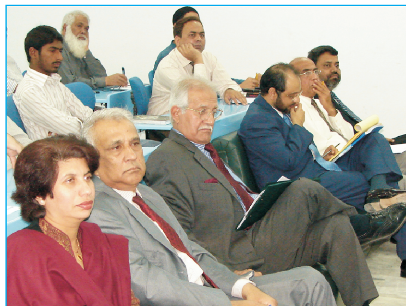
Dignitaries listening to the proceedings of the seminar

The organizers of the seminar deserve commendation for bringing together eminent scholars and intellectuals to discuss the shortcomings of public policy making in Pakistan. It is extremely important to engage in an informed debate and analysis of such issues if any serious attempt is to be made to set priorities in all domains of policy making in order to bring maximum benefit to the public at large.