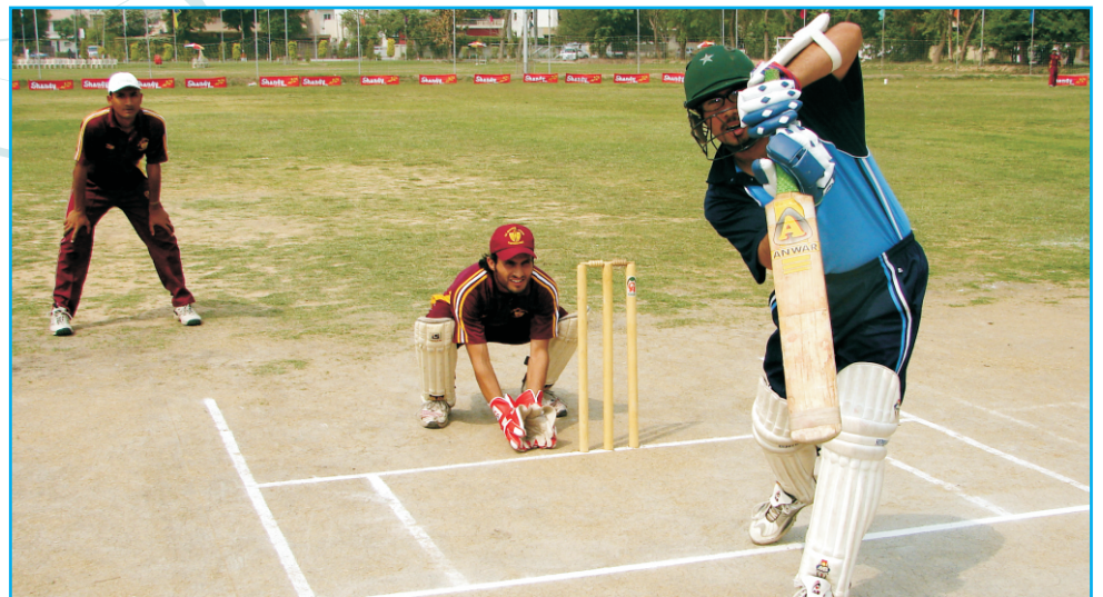
A view of the cricket match during the tournament