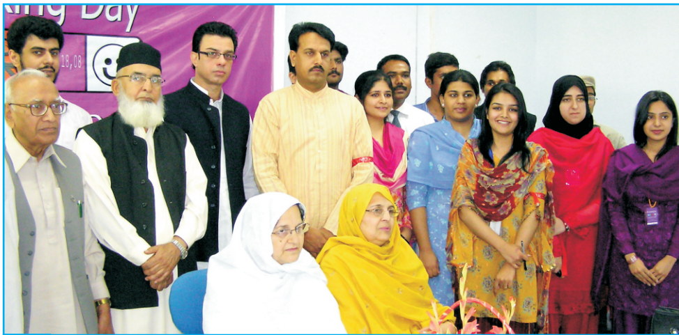
Participants of the seminar on No-smoking pose for a group photo

The adverse effects of smoking on the health of a person are well documented. Yet, a large number of our youngsters fall prey to this habit either on account of peer pressure or because they are misled by colorful advertisements that target the youth. At a time when the rest of the civilized world has turned away from smoking, we need to do everything possible to prevent our young generation from falling victim to this habit that can lead to serious health risks.