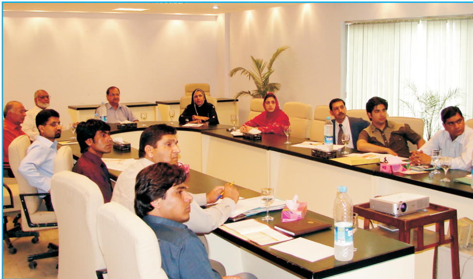
MS/PhD students attending their orientation in the UMT boardroom

It is very important for new students of the university to attend orientation sessions because they get an overview of the entire academic program. They are also introduced to their teachers and get an opportunity to question them regarding all aspects of their studies.