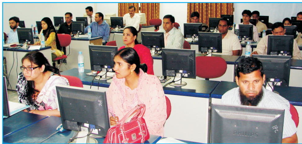
Participants of the workshop

To sum up, the workshop was a hand on practice, supported by valued reading material and exercises. We commend the organizers for conducting the workshop and for providing a forum for training of researchers. One hopes that more workshops of this kind will be organized as well in order to promote research culture in the universities of the country.