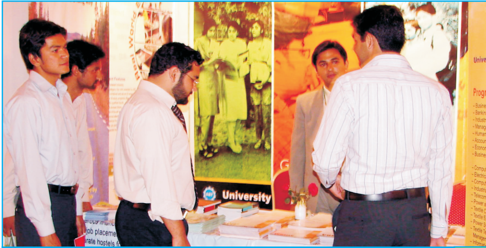
Visitors at the UMT stall at the 18th PIEE, Lahore