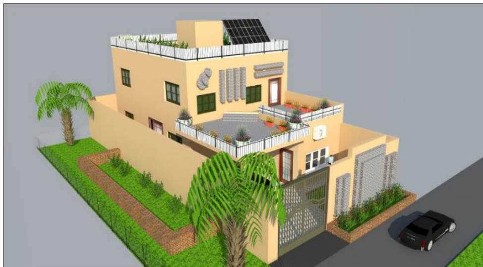
Figure 4. Proposed Building Layout

The prospective views of the proposed residential building are shown below: