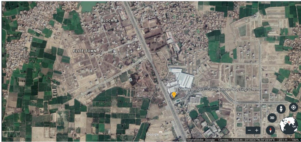
Figure 2. Location of Grand Avenue Housing Scheme, Lahore https://earth.google.com/web/@31.34046544,74.37908947,213.17296874a,2242.02407063d,35y,-0h,0t,0r .