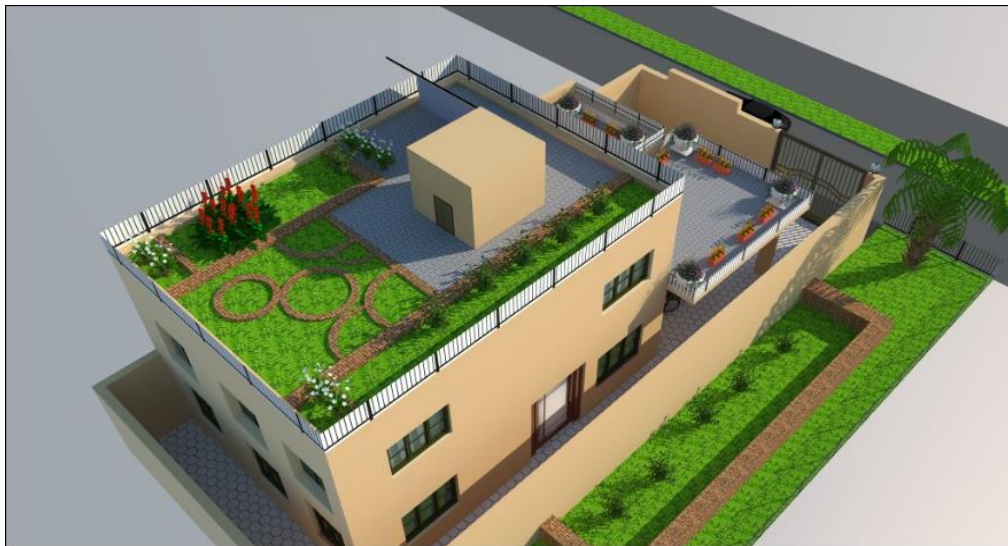
Figure 9. Roof Top Gardening