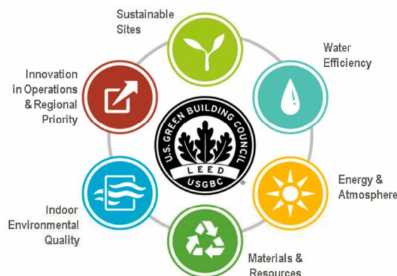
Figure 1. LEED Credit Categories

United States Green Building Council (USGBC) runs a certification program called Leadership in Energy and Environmental Design (LEED) which defines green buildings as an ecosystem comprising of six components as shown in Figure 1 (Bisagni Environmental Enterprise BEE, 2014). Together these components present a step by step approach towards creating a green building from conception to commission.