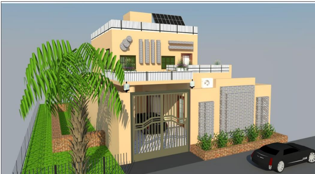
Figure 6. Outdoor Landscaping