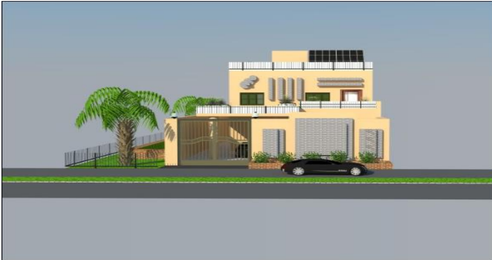
Figure 5. Front Elevation