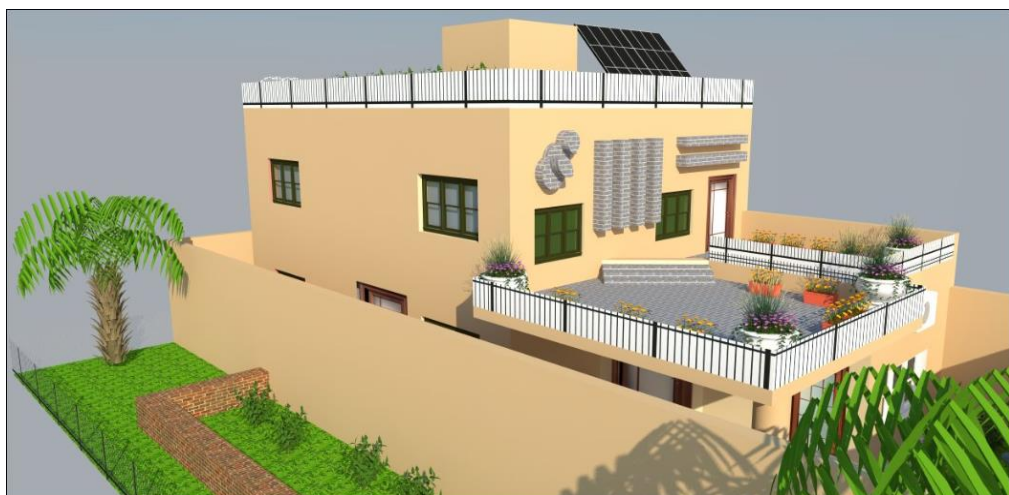
Figure 7. Windows Orientation and Low Terrace Gardening