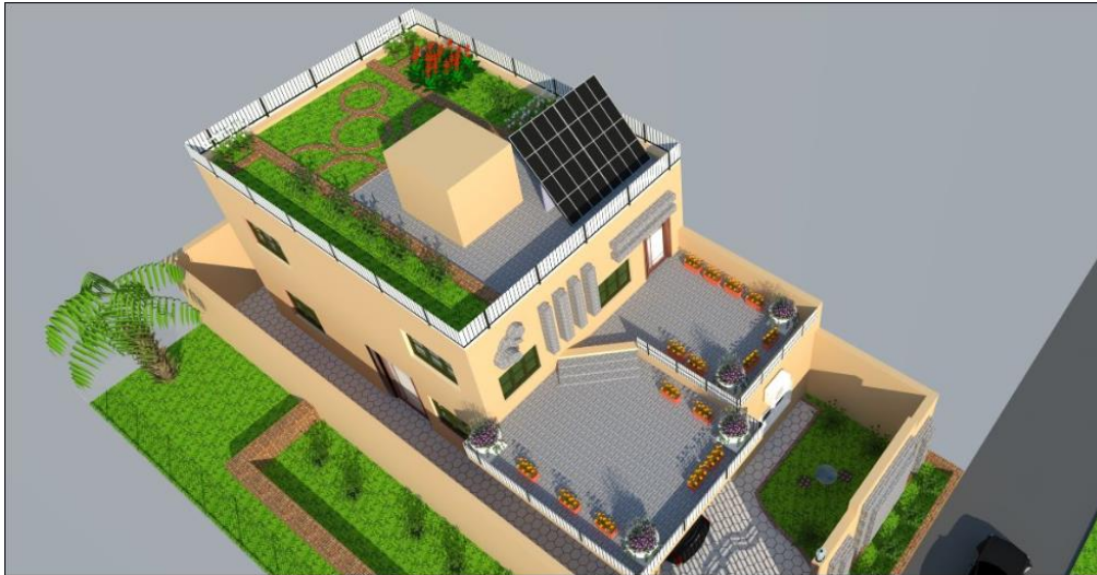
Figure 8. Top View of Building