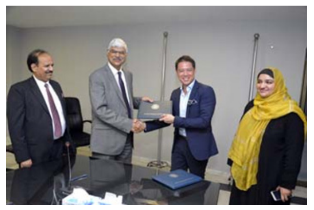
MoU Signing Ceremony between Pomeroy Academy, Singapore and DCRP, SAP