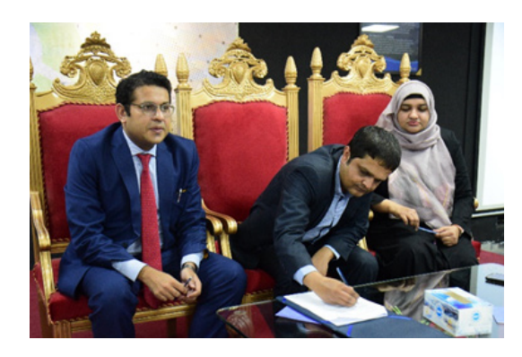
Mou signing between Future Cities Initiatives at Department of City and Regional Planning and Urban Unit Government of Punjab