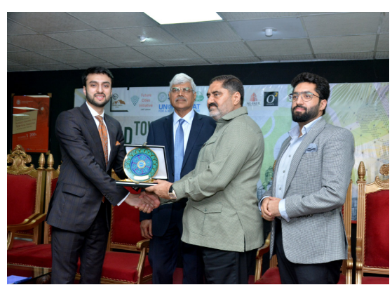
Mou signing between housing research center and Al- Jalil developers