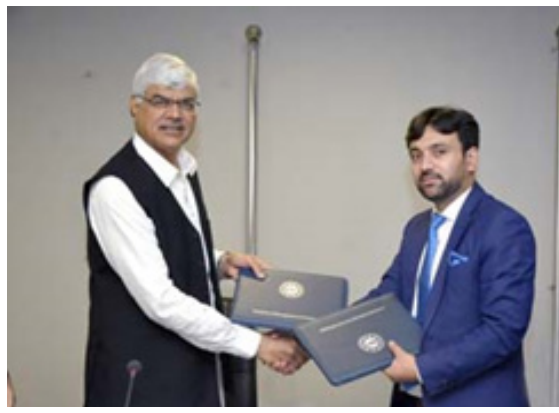
MoU Signing Ceremony between Graana.Com and Department of City and Regional Planning