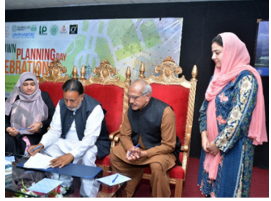
Mou signing between housing research center and PHATA