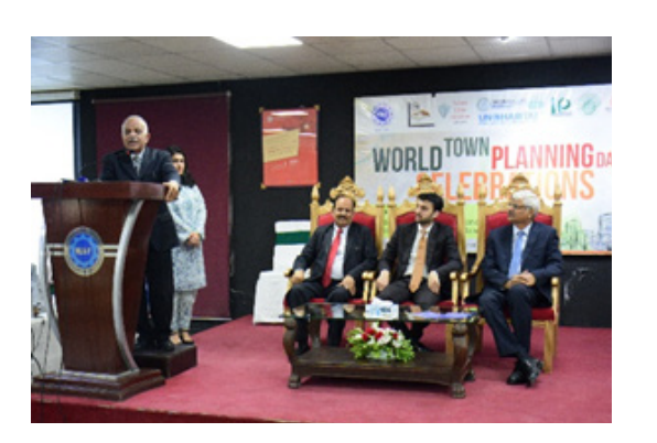
Mou signing between housing research center and The United Nations Human Settlements Programme