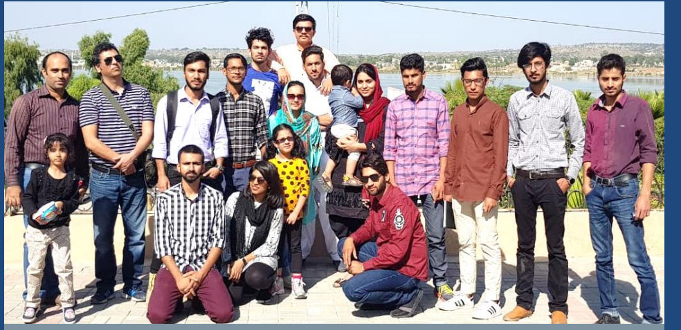
Faculty & Students of CRP went on a one day trip to Kalar Kahaar