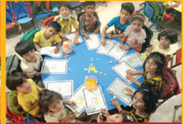
Idrees Campus, Pattoki