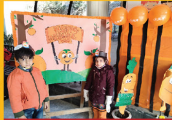
Gulbahar Campus, Peshawar