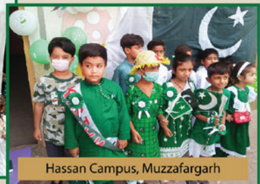
Hassan Campus, Muzzafargarh