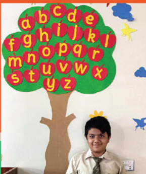
PWD Campus, Islamabad