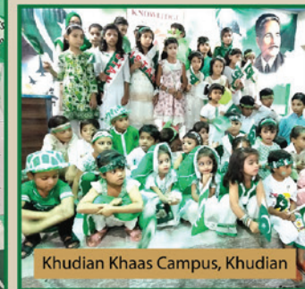
Khudian Khaas Campus, Khudian