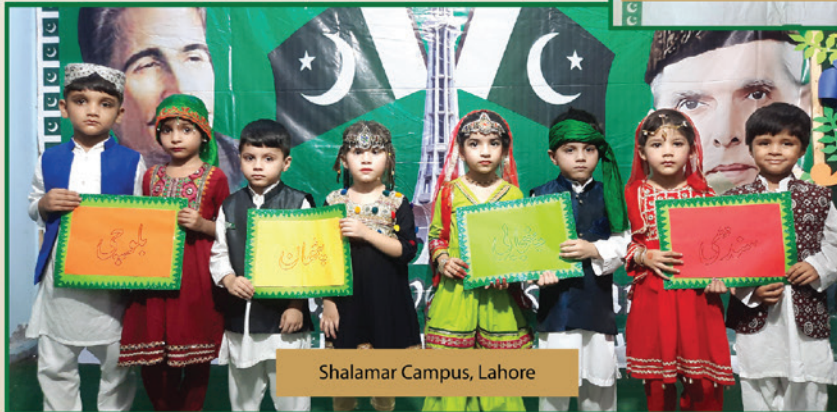
Shalamar Campus, Lahore