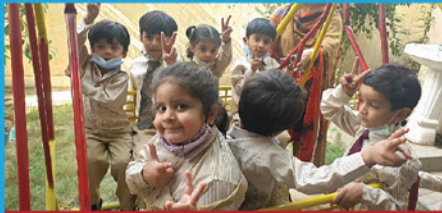
Bahawalpur Campus, Bahawalpur