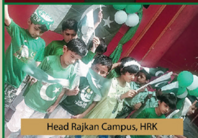
Head Rajkan Campus, HRK