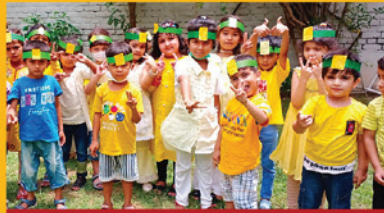
New Campus & City Campus, Okara