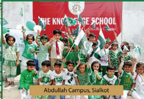
Abdullah Campus, Sialkot