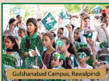
Gulshanabad Campus, Rawalpindi