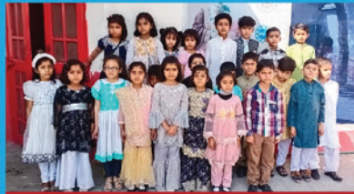
Qaboola Campus, Qaboola