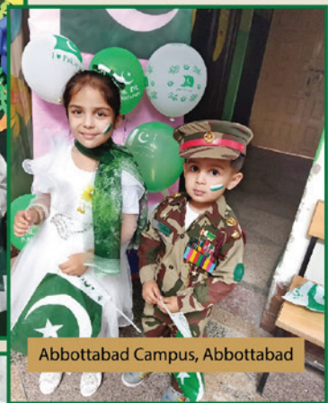
Abbottabad Campus, Abbottabad