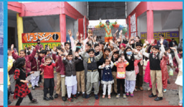
Charsada Campus, Charsada