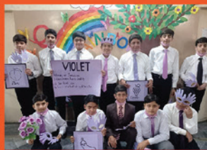
Omer Campus, Chishtian