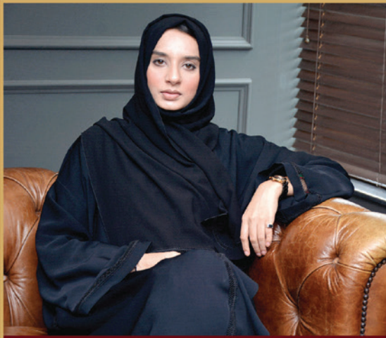
Message from Director TKS