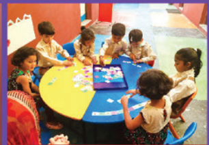
Bhagawal Campus, Sialkot