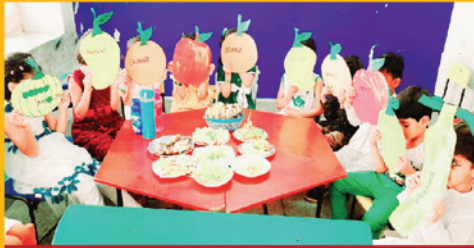
Hashmi Campus, Farooqabad