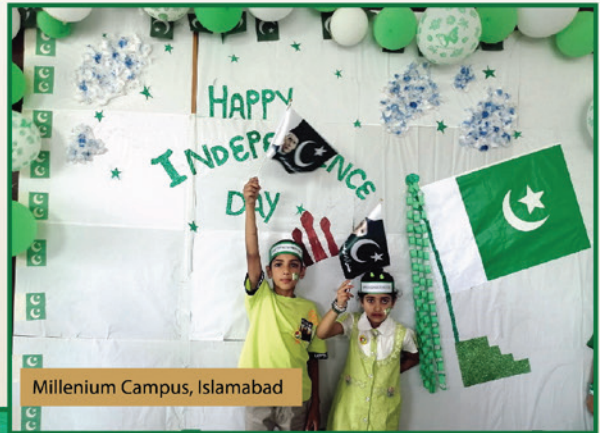
Millenium Campus, Islamabad