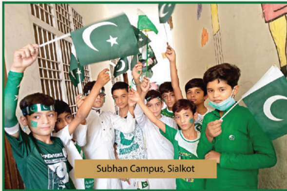
Subhan Campus, Sialkot