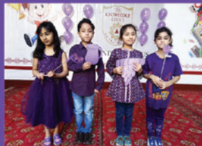
Chawinda Campus, Chawinda