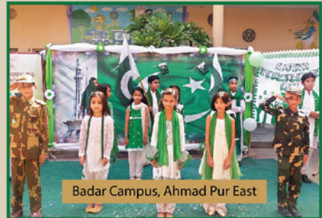
Badar Campus, Ahmad Pur East