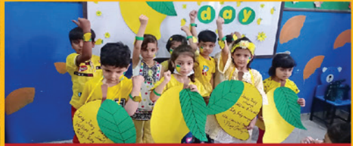
Ch Fazal Campus, Lahore