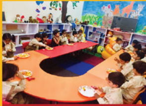
Bhagawal Campus, Sialkot