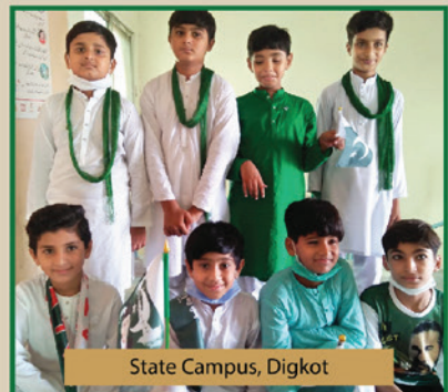
State Campus, Diglot