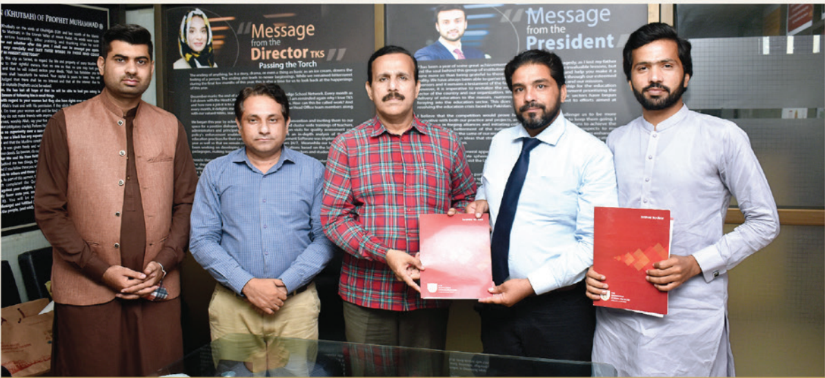
Ismail Campus, Dholan

TKS congratulates its new Network Associates on becoming a part of the TKS family.