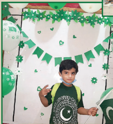
Husnain Campus, Dharanwala