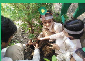
Shabbir Campus, Khanewal