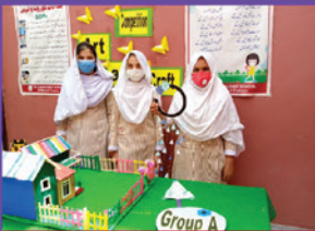
Al Shareef Campus, Mandi Tharo