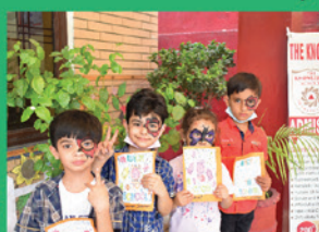
Samanabad Campus, Lahore