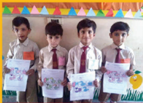
Saad Campus, Toba Tek Singh