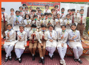
Fatima Campus, Multan