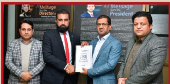
Nankana Campus Nankana Sahib