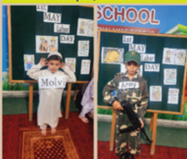
Shalamar Campus, Lahore