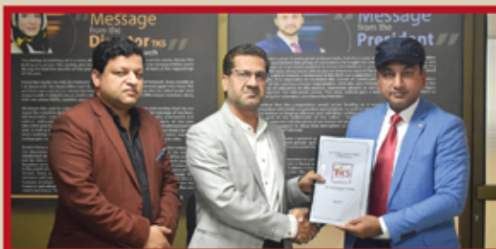
Model Campus Faisalabad