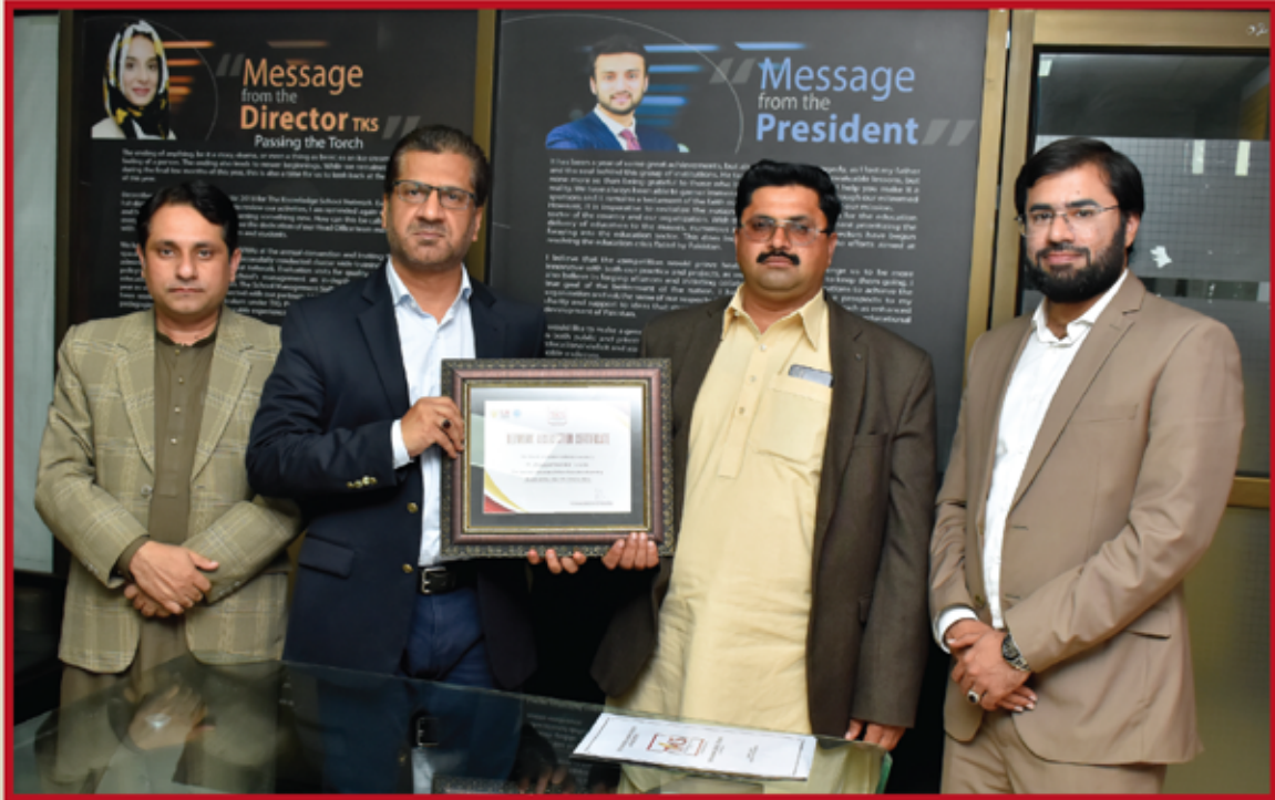
Harappa Campus Harappa

The TKS HO recently found such partners and signed MoUs with new Network Associates hailing from a variety of cities. Thus, the TKS HO is delighted to welcome TKS Nankana Campus, TKS Model Campus, TKS Hussain Campus, TKS Harappa Campus and TKS Ghauri Campus to the family and wishes them the best of luck in their journey towards becoming shining beacons of knowledge in the nation.