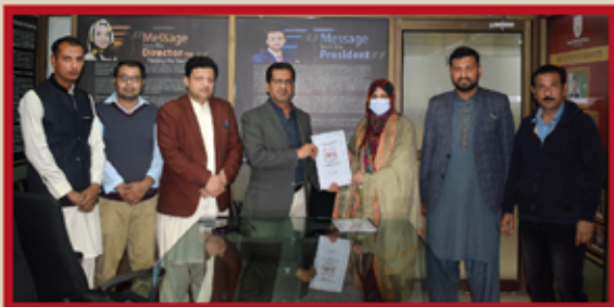
Hussain Campus Ferozewala