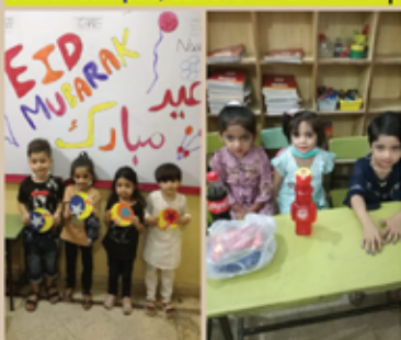
Eid ul Fitr | International Day of Peace | International Teachers' Day | Mother's Day | Pakistan Day