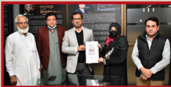
Ghauri Campus Islamabad