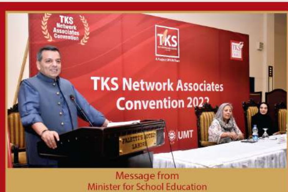
Message from Minister for School Education