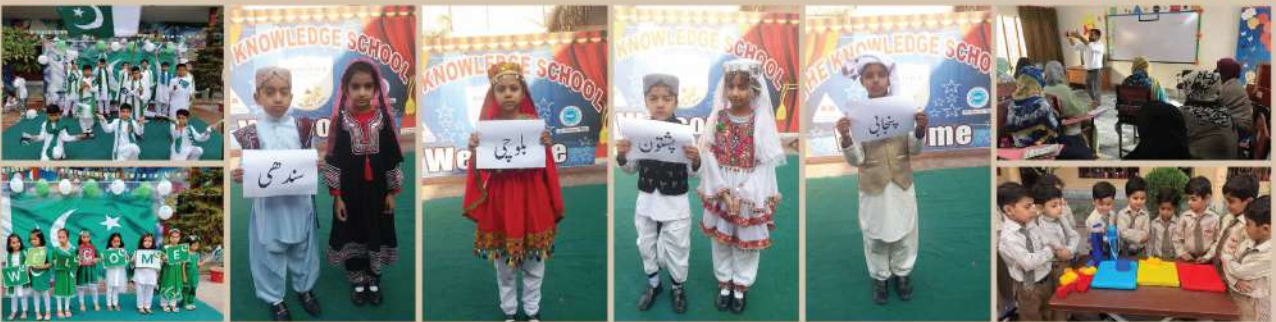
Bhagowal Campus, Sialkot