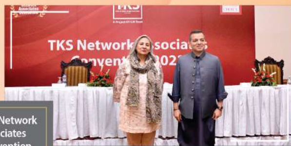
TKS Network Associates Convention 2022

Indeed, the most treasured resources we have in any organization are not to that teaching material, furniture, or the latest technology. It is actually the people who work like a family in a school, the children who hinge on us, and the families of those children who are equally important. As leaders, we must take care of everyone associated with our schools.