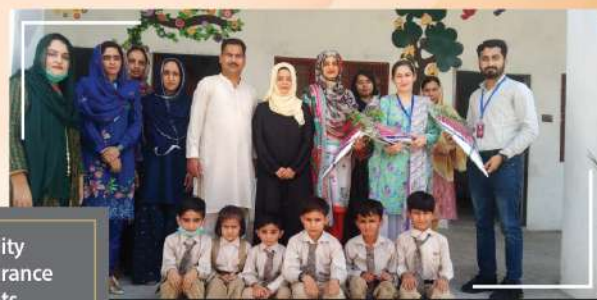
Quality Assurance Audits 2022