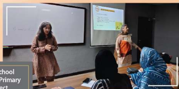
Preschool and Primary Subject Specified Training