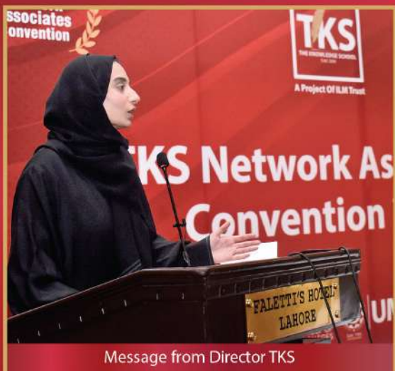
Message from Director TKS

It is a pleasure to be here with you today at the annual Network Associates Convention 2022, which brings school leaders and policymakers together to discuss fresh ideas and the latest education trends. A few years ago, when we started TKS, we had a clear vision in our minds of what we wanted to do for the future of Pakistan. Vision is extremely imperative in school management which undeniably provides the rationale for every step of the way as the school grows and evolves to best serve the nation. I would like to urge that every school must have its own vision because the requirements of every place, locality and culture are different. Vision merely is not a slogan or a written statement; it is the driving force to transform a whole school community. It does not only help you develop broader policies; but also cultivates school culture in one way or another. School vision and culture go hand in hand. Leaders who remind their school communities of the school's vision and focus on established goals can build capacity for the future.