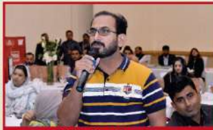
Al Madina Campus