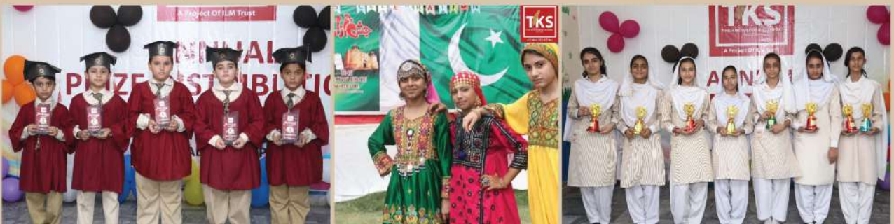
Independence Day | Prize Distribution