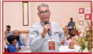
Raja Aslam Campus (Parent)