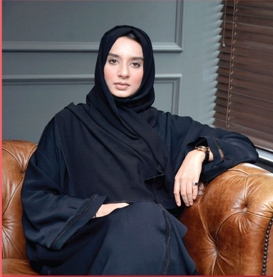
Message from Director TKS

TKS community has rejoined after summer break, I want to extend my warmest welcome to both our existing and the new Network Associates to our TKS family.