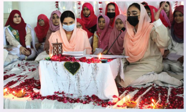
Gulbahar Campus, Peshawar