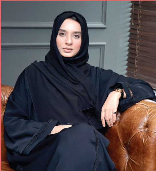
Message from Director TKS

Dear TKS NWA's, Principals, Teachers, Students and Most Respected Parents,