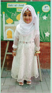
Shalamar Campus, Lahore