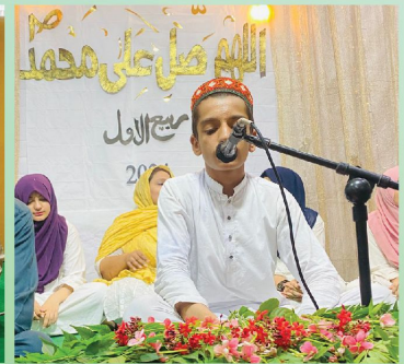
Omer Campus, Chishtian