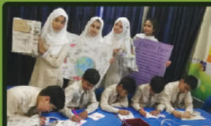
City Campus, Sialkot