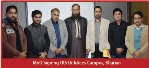
MoU Signing TKS Dr Idrees Campus, Kharian

TKS congratulates its new Network Associates on signing agreements and becoming part of TKS family.