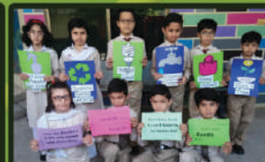
Shahab Campus, Bahawalpur