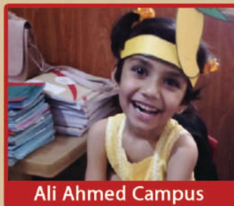
Ali Ahmed Campus