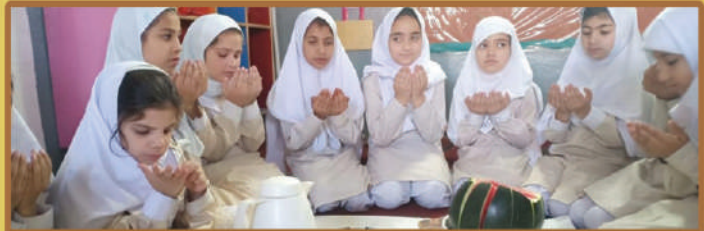
Chamkani Campus, Peshawar