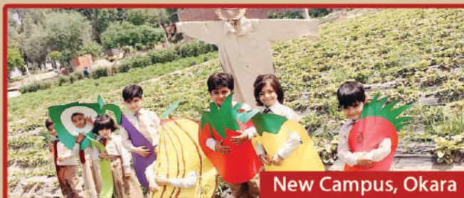
New Campus, Okara

The main objective to celebrate vegetable/fruit day is to create awareness and educate students about importance of vegetables/fruits and their benefits. Students visited the fields to see how vegetables are grown. They were also told about the importance of washing vegetables before eating and making them a part of their regular diet for better mental and physical growth.