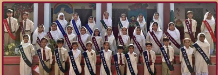
Gondal Campus, Sialkot