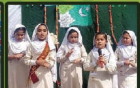
Moosa Campus, Sanjarpur