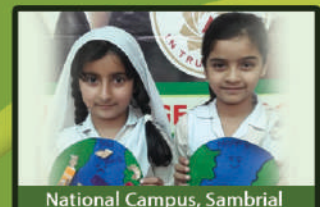
National Campus, Sambrial

To promote understanding and importance of environmental issues, TKS campuses celebrated Earth Day to support the cause of preserving nature. Students marched to create awareness among locals about the emerging risks caused by climate change and the role we have to play to save the Earth so that we may have brighter and cleaner future.