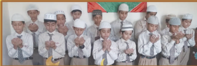
Badar Campus, Ahmedpur East

Ramadan is marked as the Holy month in the Islamic Calendar, when the Muslims strive for spiritual purification through fasting, self-sacrifice and prayers. TKS Schools welcomed Ramadan with recitation of the Holy Quran and praying. Lectures were delivered on the ethics of fasting with Islamic values to enlighten the students.