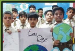
Shalamar Campus, Lahore