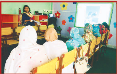
Dalazak Road Campus, Peshawar