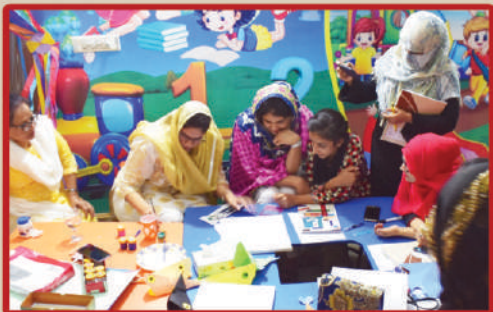
Samanabad Campus, Lahore