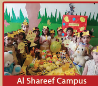
Al Shareef Campus