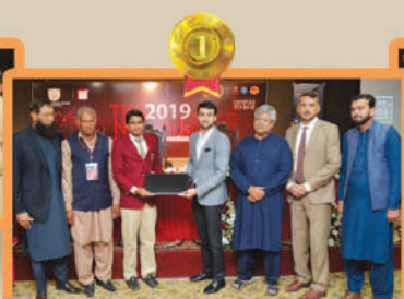
Ghulam Mustafa Roses Campus, Haveli Lakha