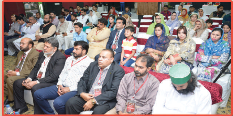
Abdul Razaq Quaid Campus, Lahore