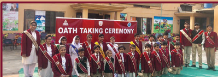
Kaiwan Campus, Lahore

To inculcate the leadership qualities and sense of responsibility, schools organized oath taking ceremonies for the deserving and talented students. They were given responsibilities for leading their schools from the front with utmost commitment. Nominated members thanked the school management for giving them the opportunity to develop leadership skills.