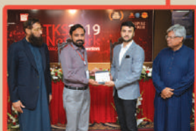
Zain-ul-Abadin Idrees Campus, Pattoki