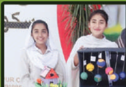
Subhan Campus, Sialkot