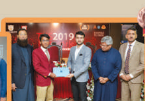
Manzor Ahmad Roses Campus, Haveli Lakha

Congratulations on Completing 10 Years of Excellence with TKS