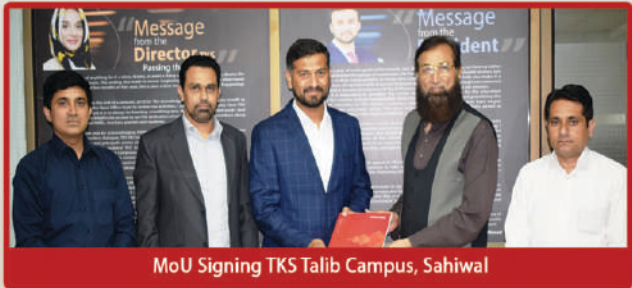
MoU Signing TKS Talib Campus, Sahiwal