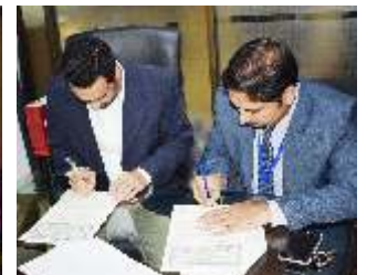
Faisal Mahboob Expo Center Campus, Lahore 19 Nov, 2018