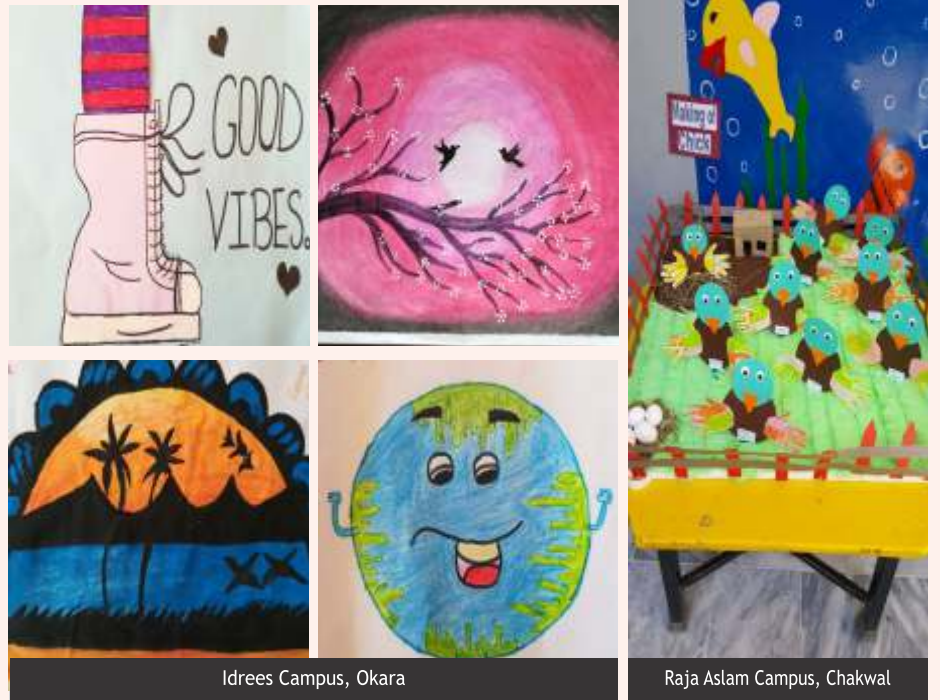
Idrees Campus, Okara