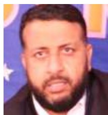
Jamal Shah Gulbahar Campus, Peshawar