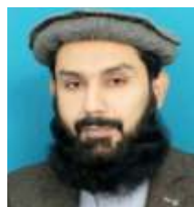
Mian Irfan Munawar Badar Campus, Ahmedpur East