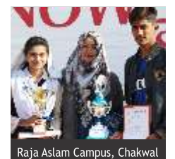
Raja Aslam Campus, Chakwal