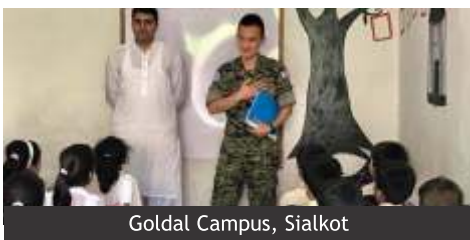
Gondal Campus, Sialkot