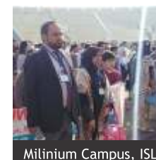
Milinium Campus, ISL

A splendid 'Sports Day' was organized by TKS at campus level, where students actively participated in different games, i.e., cricket, sack race, spoon race, tug of war and many more.