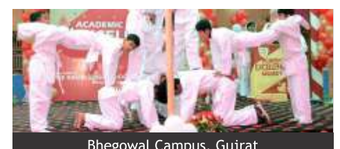
Bhagowal Campus, Gujrat

TKS Bhagowal Campus celebrated 'Academic Excellence' in full fervor. Students' sentimental performances on traditional and national songs won the hearts of parents and audience.