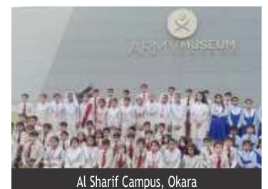
Al Sharif Campus, Okara

At TKS, our aim is to provide a balanced educational program promoting both theory and practical implications. TKS FGS Campus organized an educational visit to Pakistan Army Museum, Lahore. The purpose was to educate the students about Pakistan Army's history and their work. Such outdoor educational activities boost our students' learning skills and develop a supportive learning community.