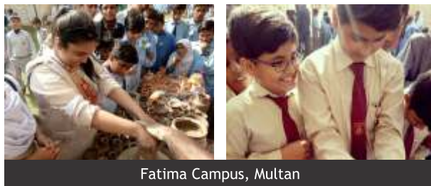
Fatima Campus, Multan

TKS Fatima Campus encouraged students to participate in CLF held on November 8, 2018. It proved as a productive activity for TKS students; they got connected with diverse group of students who belonged to different school systems from all segments.