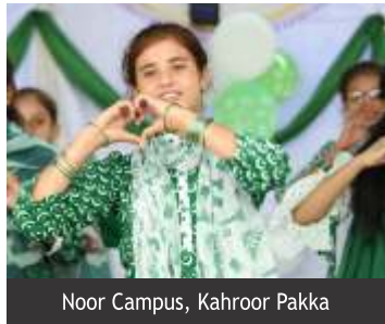
Noor Campus, Kahroor Pakka

'Quaid-e-Azam Day' was celebrated with great fanfare by TKS students in a special morning assembly. The students presented national songs portraying nationalistic spirit and highlighted the message/sayings of Quaid-e-Azam for the progress, development and prosperity of Pakistan. The students dressed in colorful attires representing the culture of four provinces of Pakistan also presented innovatively planned skits in the morning assemblies. Quiz competitions were also conducted at senior and junior level. The quizzes were based on Quaid's life, struggle for independence of Pakistan, legacy and historical view.