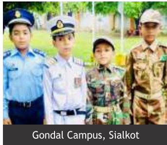
Gondal Campus, Sialkot