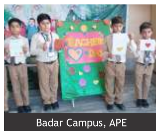
Badar Campus, APE

A good teacher has greater influence in shaping the life of an individual even more than his/her parents. In our country's culture, a teacher has been given the highest place. To honor and acknowledge the contribution made by teachers, TKS students celebrated 'Teachers Day' in full swing. Students also dedicated beautiful performances to their teachers which were highly appreciated by all.