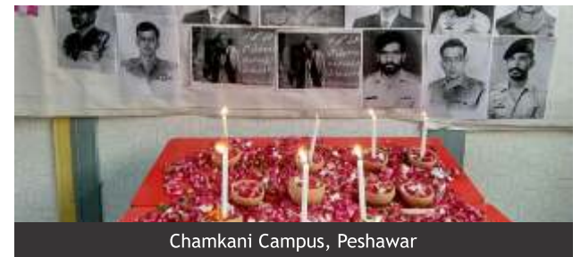
Chamkani Campus, Peshawar