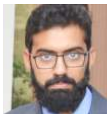
M Umer Omer Campus, Chishtian