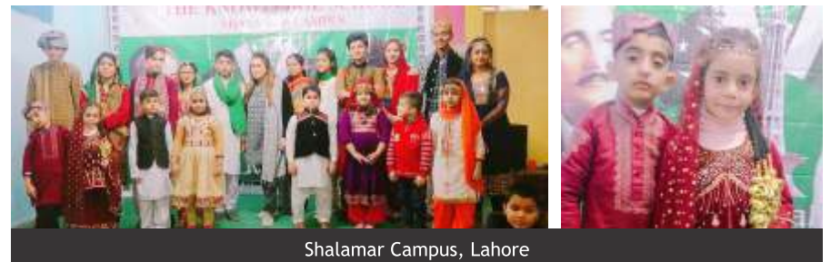
Shalamar Campus, Lahore