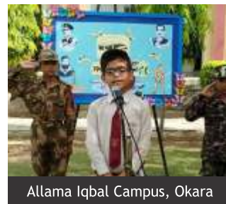
Allama Iqbal Campus, Okara

For this independence, we owe a debt of gratitude to our forefathers who sacrificed their lives to get freedom that we enjoy today. Indeed a great debt to pay! To rejoice and celebrate freedom, TKS campuses celebrated 'Independence Day' with great enthusiasm and high spirits on August 14, 2018. TKS students gave wonderful presentation and paid homage to the independence movement leaders who worked tirelessly for the cause of freedom.