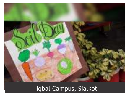
Iqbal Campus, Sialkot

The World Soil Day is celebrated annually on the 5th of December. Soil is a natural resource and plays an essential role in the growth of food and survival of humankind. However, there is a global increase in degradation of soil resources. That is why it is important that soil is celebrated every day of the year, to make sure that future generations understand the gravity of this issue.