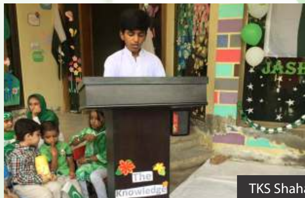
TKS Shahab Campus, Bahawalpur

The 70th Independence Day was celebrated with full vim and vigor by TKS Campuses to promote patriotism among the students. Schools paid tribute to the heroes of Pakistan whose efforts and struggles resulted in the creation of a democratic and independent nation. Variety of cultural programs were organized by students to understand the nature of struggle and sacrifices of our ancestors. The celebrations included a range of events from decorating the campuses with colorful flags, to patriotic songs and speeches which captivated the audience. Skits were also presented by the students of different classes to showcase and commemorate the freedom struggle. Pakistan is a country with millions of people living together irrespective of their religions, cultures and traditions. They celebrate this special occasion with great joy. On this day, being a Pakistani, we should feel proud and must take an oath to be loyal and patriotic citizens of this great country.