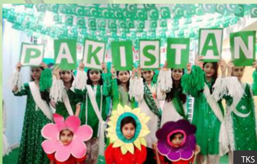
TKS Shalamar Campus, Lahore