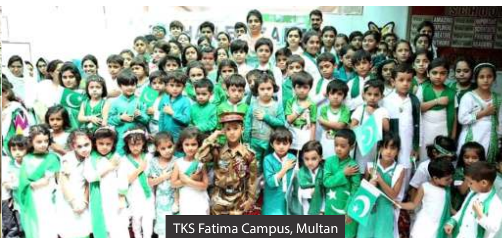
TKS Fatima Campus, Multan