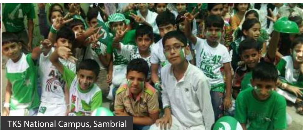
TKS National Campus, Sambrial