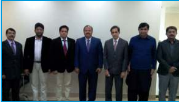
MOU signing on 9 January, 2017 - The Knowledge School for FGS campus and Allama Iqbal Okara Campus