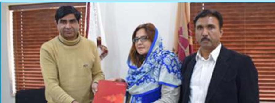
MOU signing on 14 February, 2017 - The Knowledge School for Jinnah Garden Campus, Islamabad.