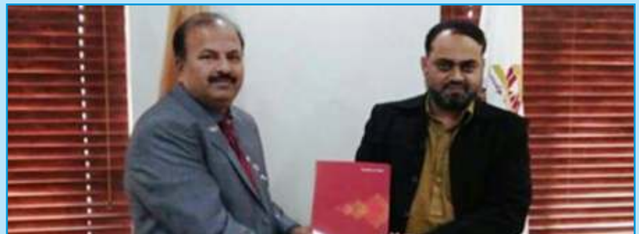
MOU signing on 31 January, 2017 - The Knowledge School for Millenium Campus Islamabad