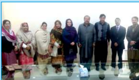
MOU signing on 13 January, 2017 - The Knowledge School for Al-siddique campus, Distt Gujranwala.