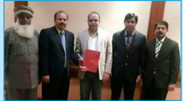
MOU signing on 15 January, 2017 The Knowledge School for Karachi campus