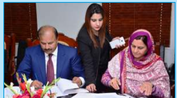
MOU signing on 18 February, 2017 - The Knowledge School for Zahra Campus, Rawalpindi.