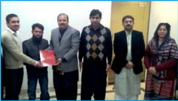
MoU signing on 30 December, 2017 - The Knowledge School for Palmtree Cantt Campus, Gujranwala