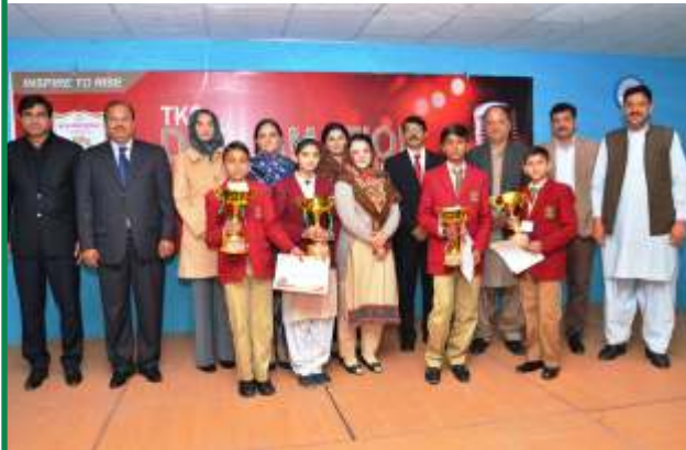
TKS Declamation Contest and Art Champ Exhibition on 23 January, 2017 at UMT, Lahore

The Knowledge School Network organized "National TKS Declamation Contest" on 23 January, 2017, after the District level competitions. In this final contest, topper contestants participated from 50+ schools of TKS network. Furthermore, Art Champ Exhibition was also organized by TKS where parents, students, teachers and school heads took keen interest to see the art work of young creative Champs displayed at the exhibition. The Declamation was divided into two