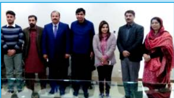
MOU signing on 9 January, 2017 - The Knowledge School for Chamkani Campus, Peshawar